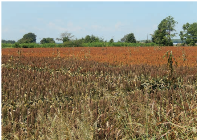
Figure 6. Reduced grain fill caused by sugarcane aphid feeding. Plants in the background with normal, reddish orange grain heads were treated with Transform® insecticide, while plants in the foreground with reduced, grayish brown heads were left untreated.

grain size and reduces grain quality by lowering test weight (Figure 6). In addition, large amounts of sticky honeydew can cause harvest losses, as well as increased equipment cleaning and repair costs. This is especially problematic in cases where sugarcane aphids have infested the grain head (Figure 7). Plants that are prematurely killed by aphids are also more prone to late-season lodging.