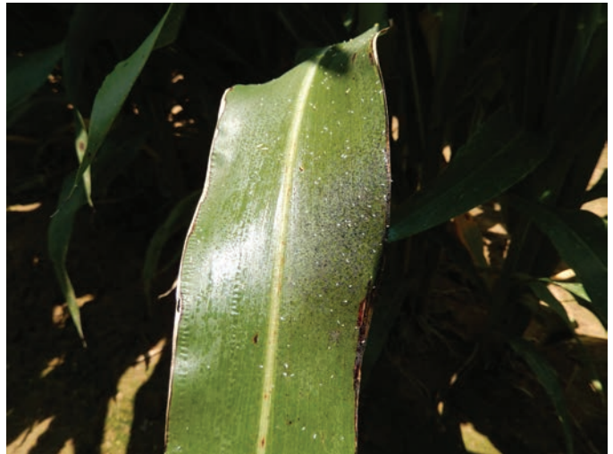
Figure 4. Honeydew coating the top of a grain sorghum leaf.