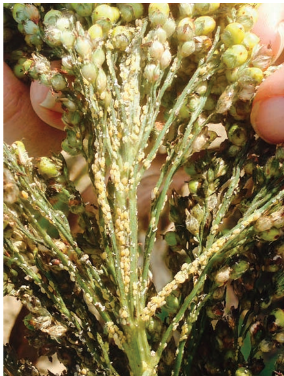
Figure 7. Sugarcane aphids infesting a grain sorghum head.