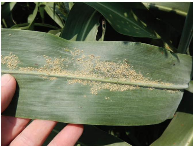
Figure 3. Sugarcane aphids colonizing the underside of a grain sorghum leaf.