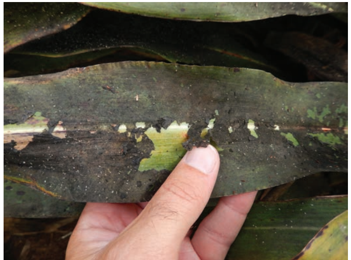
Figure 5. Black sooty mold caused by honeydew buildup.