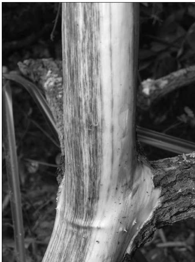
Figure 3. Black discoloration in the outer sapwood of a redbay tree 6 weeks after artificial inoculation with the laurel wilt pathogen, Raffaelea spp.

∇ Among trees inoculated with Raffaelea spp., the proportion of trees from which Raffaelea spp. was reisolated significantly differed between the propiconazole group and the untreated group ( \chi^2 = 13.33 , P = 0.0003 ).