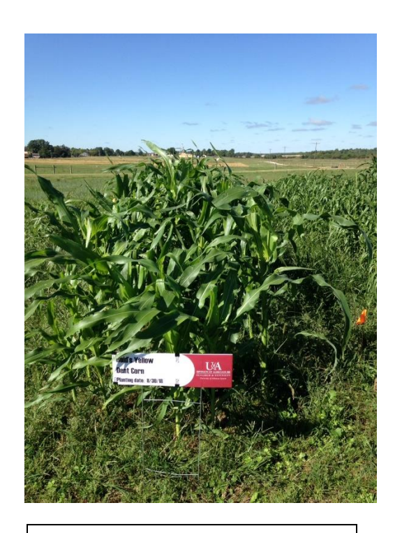
Yellow Dent Corn