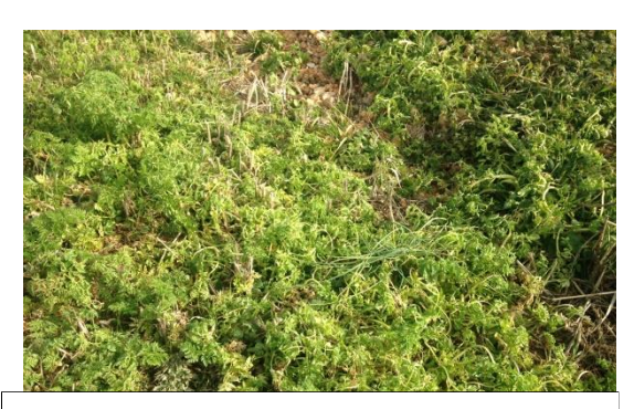
Treatment 4 Grazon P + D; considerable injury and yellowing.