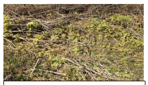
Metsulfuron treatment on March 5, 2018; all plants severely yellowed and stunted but still present. 80 % control.