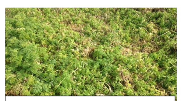
Treatment 3, Weedmaster; obvious injury from the treatment.