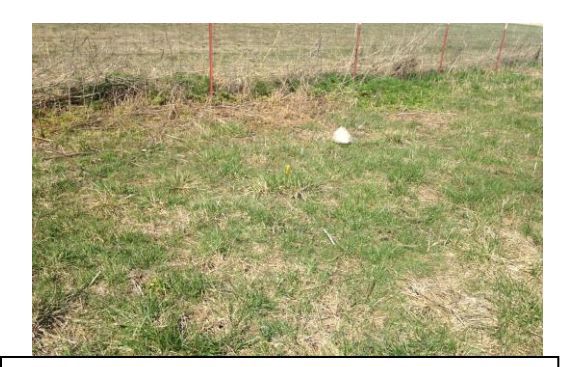
Grazon Next spray treatment along with fertilizer application on March 5, 2018; Essentially 100% control of hemlock, obviously more grass growth than other plots.