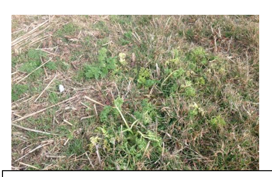
Treatment 1, 2,4-D; plants visibly twisted and some yellowing.