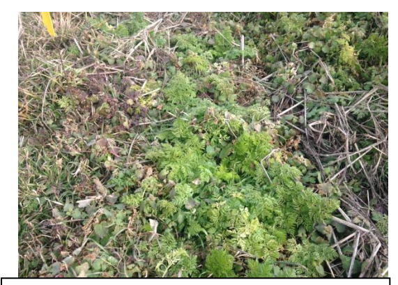
Treatment 2, metsulfuron: Plants yellowed, but no obvious twisting.