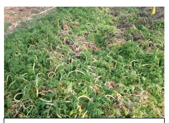
Grazon next spray plus fertilizer application; Again, considerable injury.