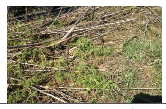
Grazon P+D on March 5, 2018; very few plants present; those that were showed considerable injury. 100% effective control.