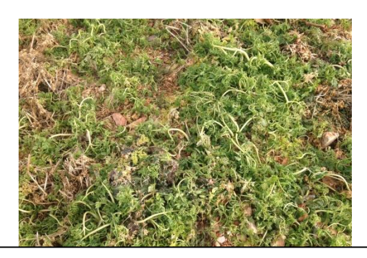
Grazon Next spray; Considerable injury.