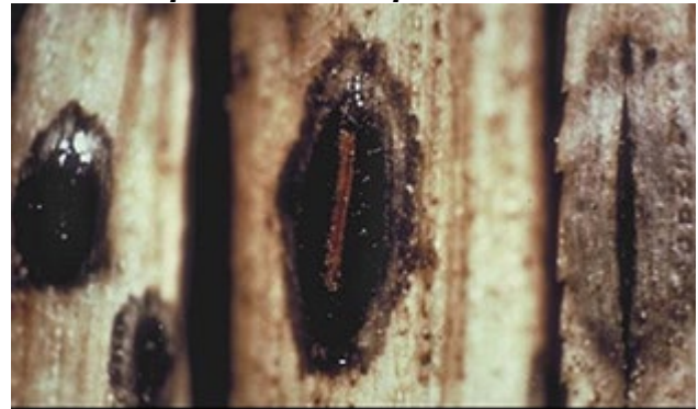
Photo by J. Staley, "Diseases of Woody Ornamentals and Trees", APS Press