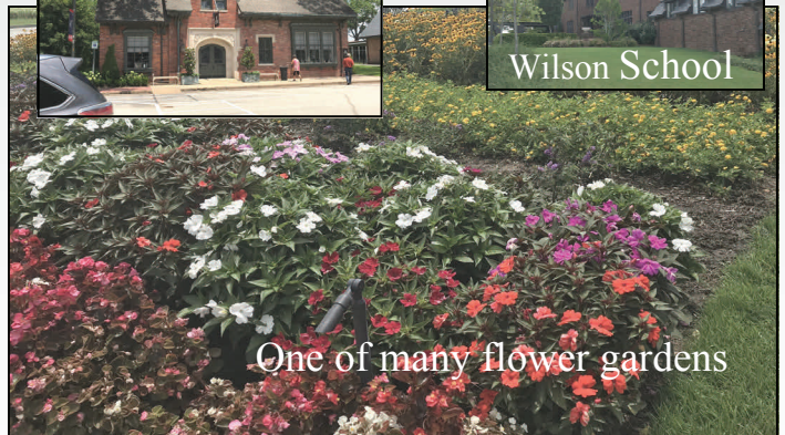
One of many flower gardens