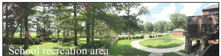
School recreation area

The Embassy Suites by Hilton will be our Conference headquarters. Hotel and conference registration times to follow.