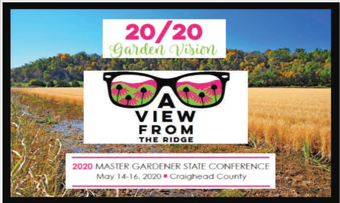
2020 MG Promo