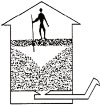
Figure 18-2. Bridged grain.