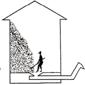
Figure 18-3. Vertical grain wall.