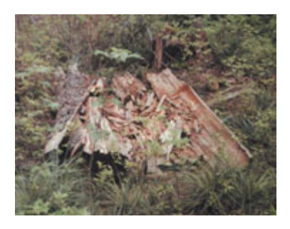
Figure 4. Bear sign on log and tree trunk.

Claw marks on trees and ripped-open logs are good field signs indicating bears are around (Figure 4). Insects are an important food to black bears, and they rip open logs with their claws and teeth to reach them. Look for claw and teeth marks on the log and for paw prints and scat on the ground around the log. Claw marks on tree trunks are thought to be a means of communication between bears, and will be about 3 to 6 feet off the ground.