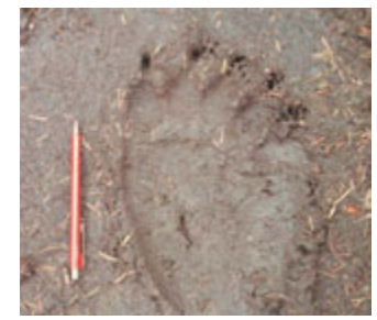
Figure 3. Bear paw prints. Forepaw (left), hindpaw (right).

Bear scat (feces) is another field sign that a bear has been in an area. Its appearance depends on what the bear has been eating. If the bear has been gorging itself on young, succulent vegetation, the scat will appear as an amorphous pile of partially digested plant material. If the bear has been eating dryer plant material, such as leaves or acorns, however, the scat will be cylindrical and about 1 1/2 inches or so in diameter.