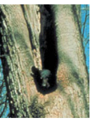
Figure 1. The American black bear in a tree and in its den at the White River National Wildlife Refuge.

destruction. In the early 1900s, much of Arkansas' forestlands were logged and cleared for farmland. By the 1930s, less than 50 black bears were thought to remain in the state, with most residing in what is now the White River National Wildlife Refuge in southeastern Arkansas.