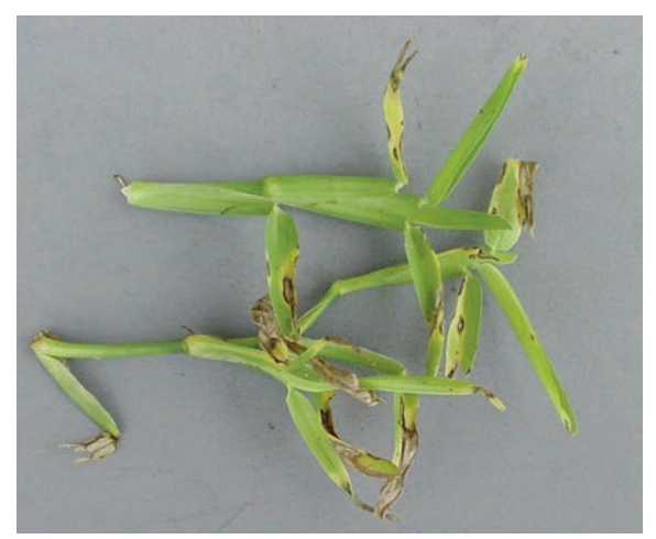
Figure 2. Leaf lesions of Pyricularia grisea on St. Augustinegrass