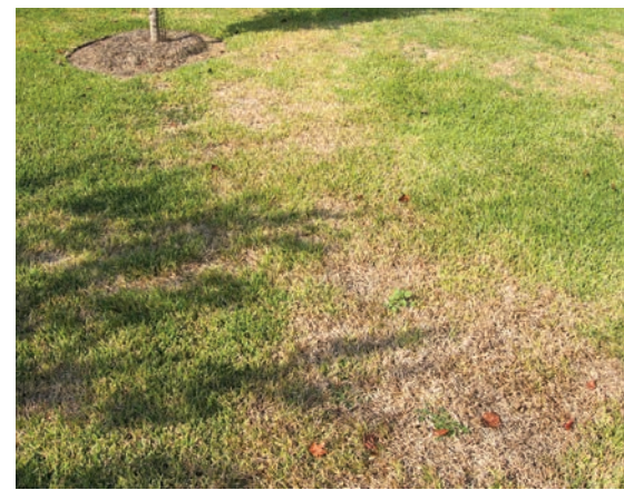
Figure 1. Blighted areas of St. Augustinegrass leaf infections. Heavily spotted leaves - with gray leaf spot

wither, giving the turf a thinned appearance and leaving irregular patches or streaks of blighted and chlorotic turf. From a distance, affected turf may resemble drought stress or other abiotic problems (Figure 1). Leaf spots start as small, dark brown lesions that enlarge into an oval or elongated area on the leaves or sheaths. Lesions later appear as a tan, "diamond-shaped" spot with a narrow purple or brown margin. Sometimes the spots have a yellow halo surrounding them (Figure 2). During moist weather conditions, the spots become covered with a gray, velvety layer of spores and mycelium. Numerous spots may grow together to turn the entire leaf brown. Microscopic spores (Figure 3), which measure approximately 21 microns in length, resemble miniature "snowshoes" and are dispersed by splashing water or wind. Spores or mycelium of the fungus may overwinter in turf debris. This plant debris can be a source for new infections in the summer. Subsequent infection may not occur until favorable environmental conditions develop. Extended periods of dry weather may slow disease development and symptom expression.