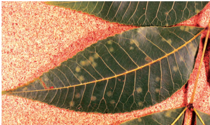
Figure 4. Early downy spot on pecan foliage

Downy spot produces leaf spots that are pale green to white ( Figure 4 ). Spots from 1/8 to 1/4 inch across form on the undersides of the leaflets and then become brown on the upper surface. Spots develop a faded appearance, and infected leaflets drop from the tree in early August.