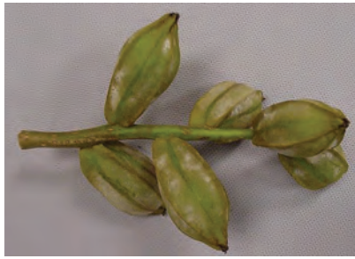
Figure 3. Powdery mildew on nuts

Symptoms of powdery mildew are most obvious when the nuts become covered with a white, fuzzy growth on the surface ( Figure 3 ). Infections that occur in the early stages of nut development may also lead to a reduction in nut size, while late-season infections have only a minor effect on nut quality. Leaf infections often result in misshapened and wrinkled leaflets.