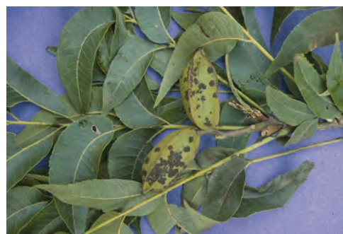
Figure 1. Pecan scab on nuts

extended periods of wetness and dew on leaves and nuts are critical for infection and disease development. The scab fungus forms small, circular, olive green to black sunken spots or blotches on leaves, nut shucks (husks), leaf blades and leaf petioles ( Figures 1 and 2 ). Leaf spots may become numerous, leading to premature leaf drop, and may lead to infection of the nuts. As spots on the nut shuck grow together, entire nuts may become blackened. Other fungi such as pink mold quickly colonize the damaged nuts causing additional decay. Scab infections of the shucks may also produce “stick tights,” a condition in which the shuck does not separate from the nut during harvest.