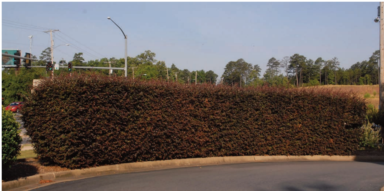
Plum Delight ® Chinese fringeflower

Since their introduction to the retail trade in the late 1990s, the purple-leaved forms (var. rubrum ) of Chinese fringeflower have made a profound impact on our landscapes. Many of the non-dwarf forms (Plum Delight ® , 'Zhuzhou Fuchsia' and 'Blush') would make an excellent sheared hedge in central and south Arkansas.