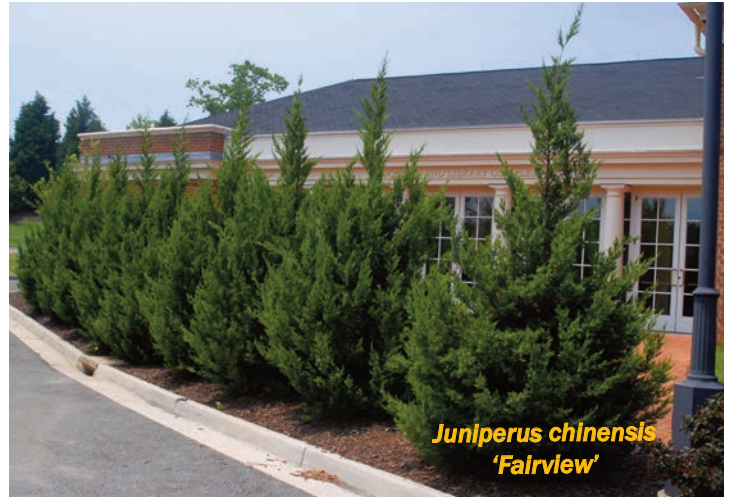
Juniperus chinensis 'Fairview'