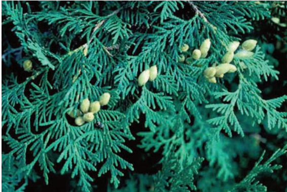
'Emerald' Eastern arborvitae

This needle-like evergreen is the most common hedge or screen plant in the Pacific Northwest and Midwest. It is known for its beautiful emerald green color and tight, upright growth habit. Because it lacks heat tolerance, it is a better choice in northwest Arkansas than in central and south Arkansas. Eastern arborvitae is more tolerant of shade than many other needle-like evergreens.