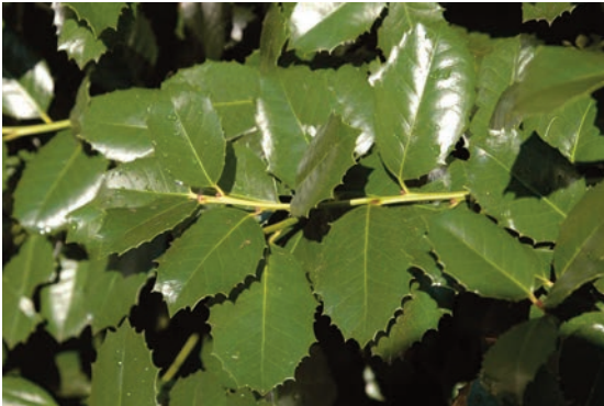
'Emily Bruner' holly

This is a dense, pyramidal-shaped female clone with red fruits, and it is probably best suited to central and southern Arkansas.