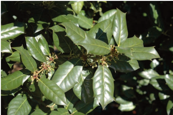
'Nellie R. Stevens' holly

'Nellie R. Stevens' is hard to beat for hedge or screen purposes. 'Nellie' is a large broadleaf evergreen with a pyramidal shape that can reach 20 feet. This holly is interesting in that it will set fruit without pollination.