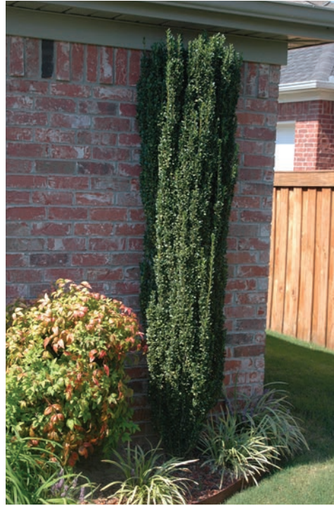
'Will Fleming' holly

'Scarlet's Peak' is another columnar (20' x 3') selection.