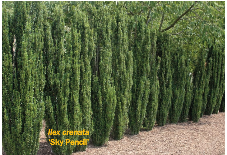
Ilex crenata 'Sky Pencil'