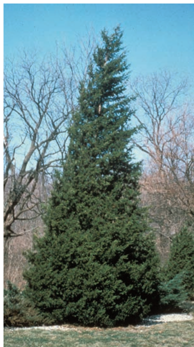
'Keteleeri' Chinese juniper

Chinese junipers range in habit from low, spreading shrubs to large, upright plants. A number of cultivars would be useful as hedge or screen plants. Needle color will vary from a green ('Fairview' and 'Keteleeri') to a blue-green ('Iowa'). Be forewarned, Chinese juniper tends to be susceptible to fungal tip blights ( Phomopsis , Kabatina ) in Arkansas.