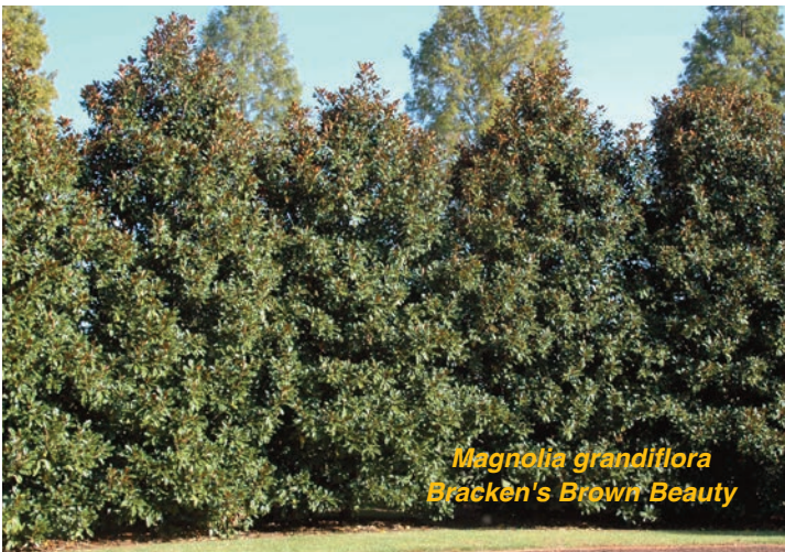
Magnolia grandiflora Bracken's Brown Beauty