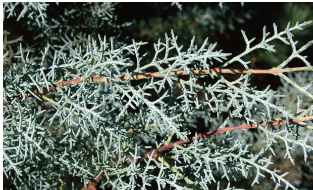
'Blue Ice' Arizona cypress

The growth habit of young plants is very similar to our native eastern redcedar ( Juniperus virginiana ). Because needles are not borne in flat sprays like Leyland cypress, the overall texture is very soft. Plants are clearly taller than they are wide and pyramidal in shape. As the plant matures, it will open up. Very old specimens almost have a weeping, graceful pyramidal appearance. Arizona cypress thrives on full sun in exposed situations. While constant moisture might promote growth, an established plant should tolerate fairly dry conditions. Avoid wet spots.