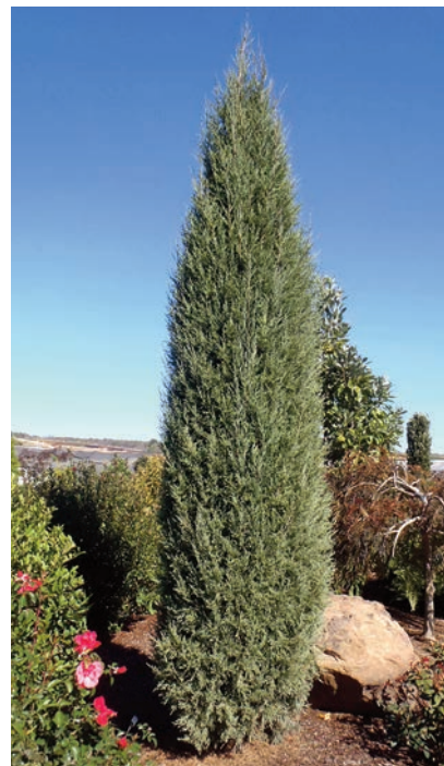
'Taylor' Eastern redcedar

Although our native landscape is swarming with Eastern redcedar, this plant is not as common in our retail trade. A number of excellent cultivars ('Idyllwild', 'Manhattan Blue', 'Brodie' and 'Taylor') are good choices for a large screen or hedge.