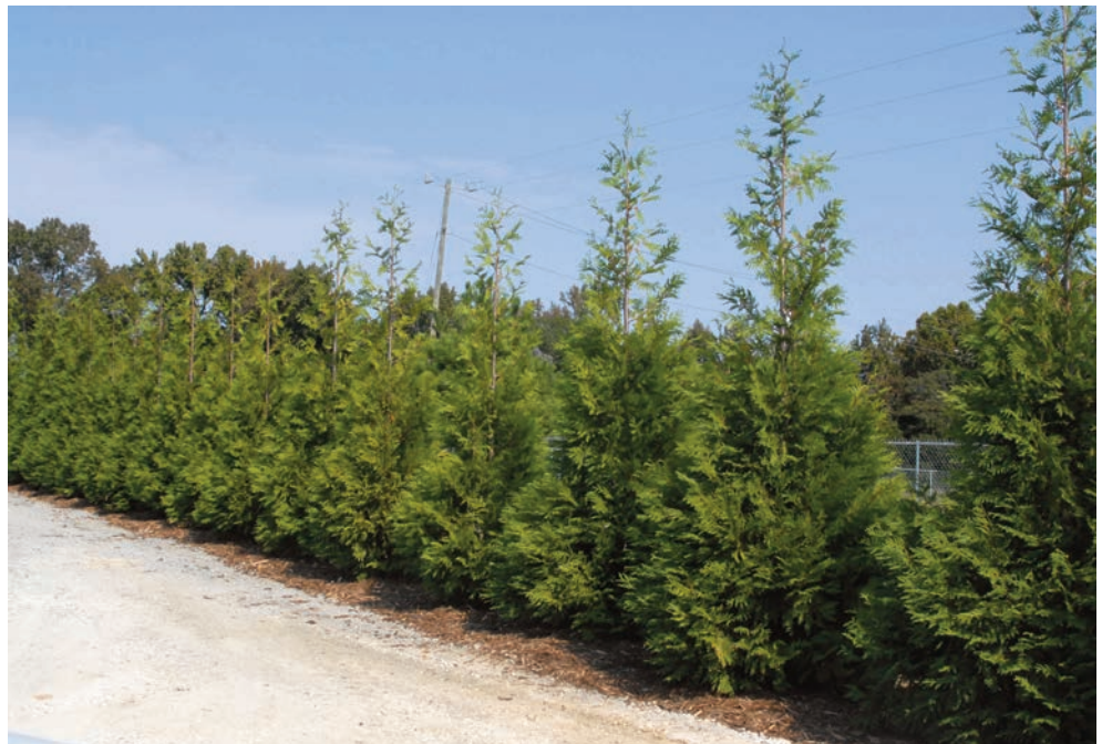
'Green Giant' arborvitae

Introduced to the retail trade in the early 2000s, this is essentially an eastern arborvitae on steroids! This strongly pyramidal evergreen grows very fast. Once established, this plant should grow at least 2 feet per year. Mail-order catalogs suggest 'Green Giant' is deer resistant. Because it is an arborvitae, people always question whether it is susceptible to attack by bagworms. Based on results from the University of Arkansas, this plant is very susceptible to that insect. The trial also indicates that this plant is not tolerant of very wet soils. Preferred exposure would be full sun to partial shade. 'Green Giant' grows so fast that the central leader does not fill-in until the following year. 'Green Giant' may also be sold in the trade as 'Giganteoides' or 'Spring Grove.' The extreme heat in 2012 demonstrated that 'Green Giant' is not as heat tolerant as some evergreens such as Arizona cypress or Eastern redcedar.