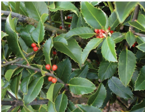
'Martha Berry' holly

While rare in the trade, this group of hybrid hollies would make an exceptional screening plant. The foliage is typically a very dark green, and the edge of the leaf is lined with distinctive teeth (serration). A number of worthy cultivars include 'Hohman,' 'Wirt L. Winn' and 'Martha Berry.'