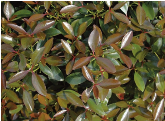
LeAnn™ Japanese ternstroemia

Most retailers still sell this plant under the genus name Cleyera . In the past, Ternstroemia was primarily grown from seed, which resulted in a great deal of variation in habit that was not good for formal hedges. Several nurseries select and propagate improved selections from cuttings. Some of these new selections include LeAnn™ and Bronze Beauty™. The new foliage on many of these is an attractive deep red, somewhat reminiscent of redbud photinia. Most of these tend to be rounder than redbud photinia with a mature size of 9 feet tall by 9 feet wide. The growth rate of Ternstroemia will not be as fast as some other hedge options.