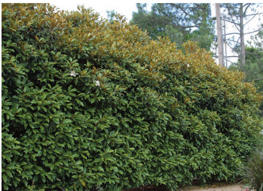
'D. D. Blanchard' Southern magnolia

Surprisingly, the Southern magnolia makes an excellent large screen. Several cultivars ('Little Gem,' 'D. D. Blanchard,' 'Bracken's Brown Beauty,' Alta ® and 'Hasse') have a dense pyramidal form that lends itself well for this landscape purpose.