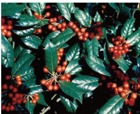
Burford Chinese holly

Like 'Nellie R. Stevens,' this is a standard in the retail trade. It can be easily separated from 'Nellie' by looking at the number of sharp teeth on the leaf margin. 'Burfordii' typically has fewer teeth. Burford holly will tend to be more rounded than some other hollies.