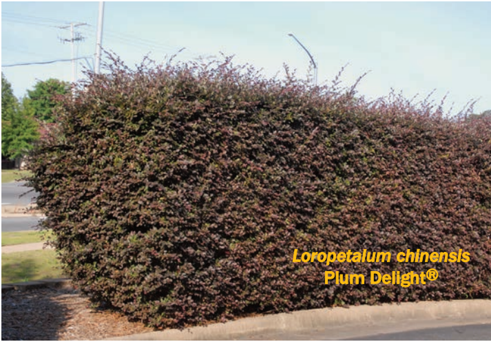
Loropetalum chinensis Plum Delight®