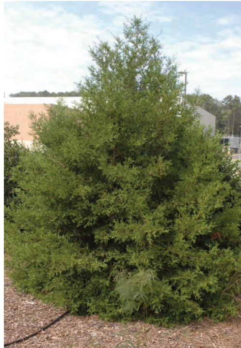
'Emily' Atlantic whitecedar

This plant performed exceptionally well in the University of Arkansas Plant Evaluation Program. The plant looks very much like the native eastern redcedar. The species is unique in that it tolerates wet, boggy sites in the wild. It is a very fast-growing plant and appears to be not quite as narrow as 'Green Giant' arborvitae.