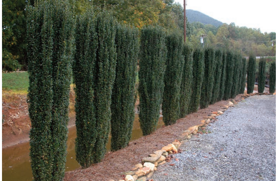
'Sky Pencil' Japanese holly

This uniquely shaped Japanese holly was originally discovered in the wild on Mount Daisen in Japan. The plant was given to a group of plant collectors from the U.S in 1985. In 1992 it was distributed by the U.S. National Arboretum. In habit, it is similar to the upright form of Yaupon holly ( I. vomitoria 'Will Fleming'); however, 'Sky Pencil' splays less. Another cultivar, 'Steeds,' would also be a good choice for hedging. It is noticeably wider than 'Sky Pencil'.