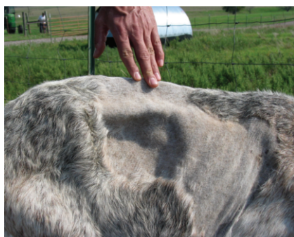
BCS 1. Weak and bony. You can fit your fingers between the bones of the backbones and rib bones. No fat and little muscle.