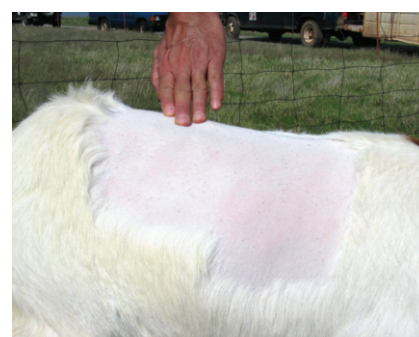
BCS 3. The backbone is visible, but does not stand out. You must press firmly to get your fingers between the ribs and they have a moderate covering of fat.