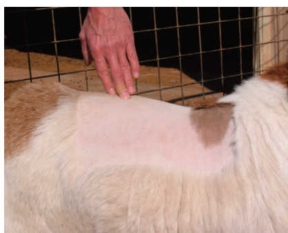
BCS 4. The backbone and ribs cannot be seen. The ribs are sleek and the bones can barely be felt under a layer of fat.