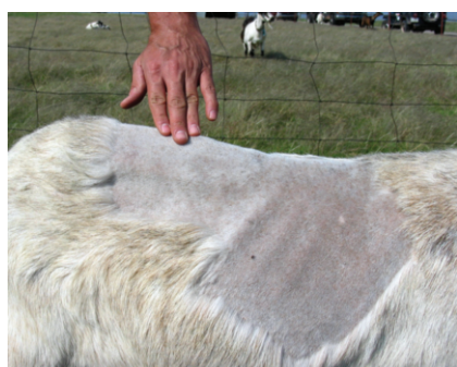
BCS 2. Slight fat cover on the ribs, but you can still see and feel the backbone and spaces between the ribs.