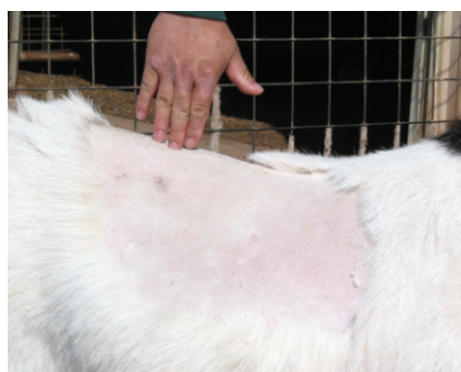
BCS 5. The backbone and ribs are so deeply covered in fat as to not be seen or felt.