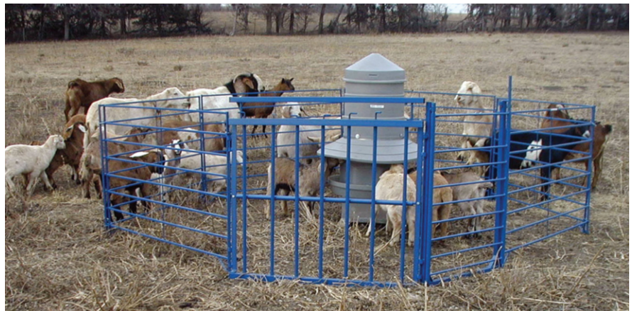
Creep feeders allow you to provide extra energy and protein to growing kids without competition from their dams. (Image courtesy of Sydel, Inc., www.sydel.com )

As goats approach the breeding season, they should be in good body condition, neither too thin nor too fat. Underweight and overweight goats have difficulty breeding and becoming pregnant. They should have a body condition score of three on a scale of one to five, with five being obese and one being emaciated. See FSA9610, Body Condition Scoring