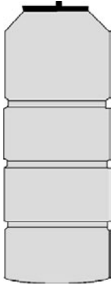
Storing water is also recommended since water supplies may be cut off or contaminated.

Chemical Treatment: Chemical treatment is less desirable than heat treatment because the effectiveness is dependent on several variables, such as (1) the amount of organic matter in the water, (2) water temperature and (3) the length of time after the chemical is added until it is used.