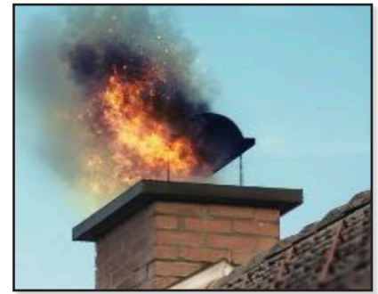
Figure 5. A typical chimney fire ( https://mffire.com/prevent-chimney-fires )