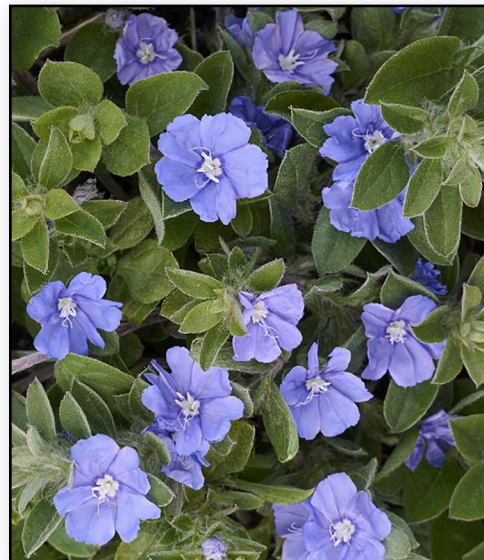
‘Beach Bum Blue’ Evolvulus