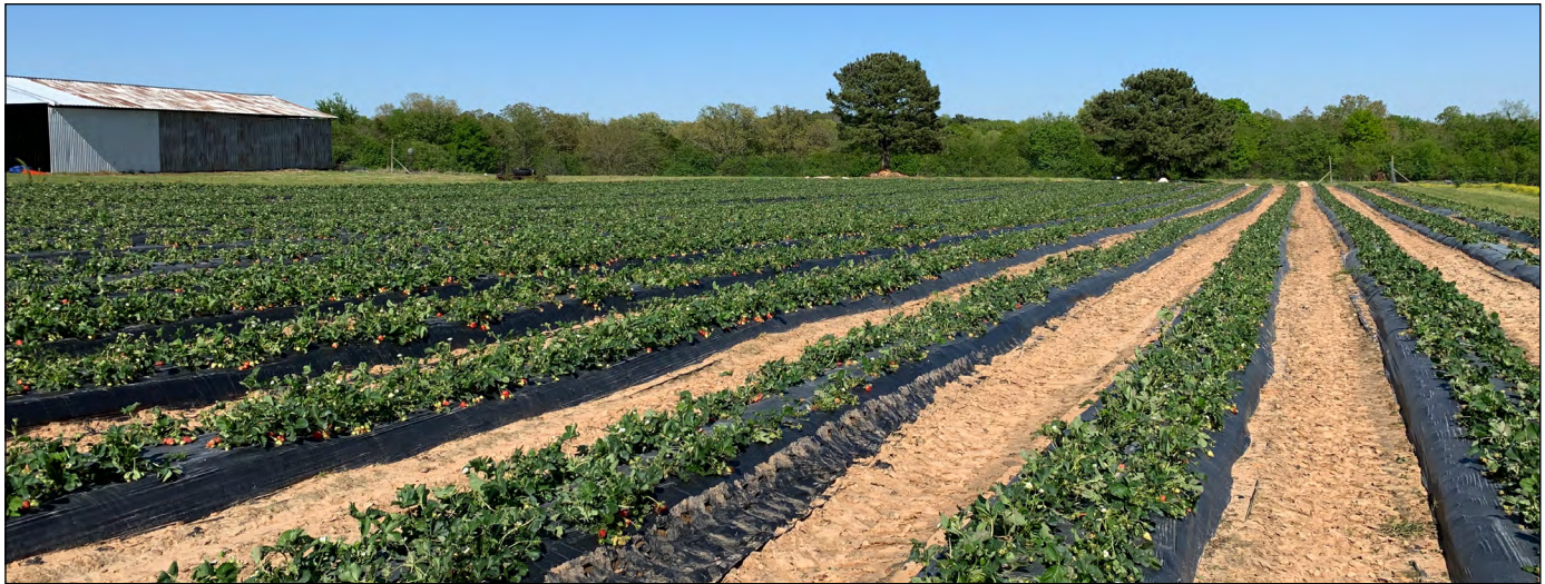
Figure 4. Strawberries growing in an annual plasticulture production system in the Southeast.

plasticulture system, new plants are transplanted every year in the fall. After spring harvest, plants are killed and removed from the field. This allows for crop rotation with crops that are non-hosts to strawberry diseases. This practice can cause a break in pest cycles and reduce the pathogen population in the field 12 . It is generally recommended to allow 1-3 years between planting of strawberries in the same field and to utilize non-related crops or cover crops when not growing strawberries in these areas. Growing plants on a raised bed, in full sun, with adequate spacing and weed control will help decrease the risk of infection as air circulation is increased, which helps to facilitate the drying of plant tissue. Additionally, plants and developing fruit are elevated above most standing water when grown on a raised bed, which helps reduce the risk of infection of fruit rot diseases.