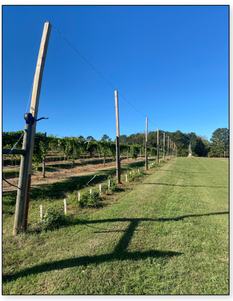
Figure 1. Hopyard established on a modified grape trellis at the UA System Fruit Research Station in Clarksville, AR.

A study evaluating hops production was conducted at the UA Agricultural Experiment Station's Fruit Research Station in Clarksville, Arkansas from 2018-2021. The hopyard was planted on the end row of a 7-acre vineyard that used a single curtain grape trellis system (Figure 1). The trellis system for that row was modified for hops production since it has been shown that grape trellises can be easily modified to support hops plants (Kneen 2003).