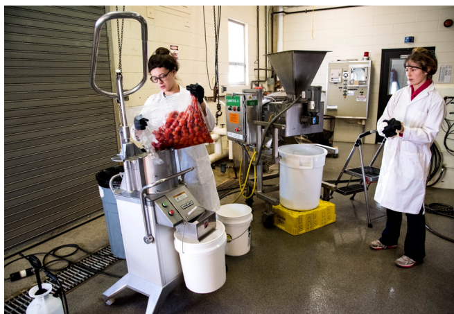
Figure 3. Value-added food product production at a food manufacturing facility. Arkansas Food Innovation Center is located at the University of Arkansas System Division of Agriculture Food Science Department in Fayetteville, AR.

will be needed to produce VAFP that do not fall under the Arkansas Cottage Food Law. A food product can be sold in any commercial market if it is made in a food manufacturing facility.