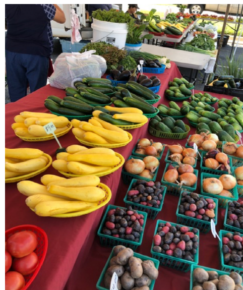
Figure 1. Produce display at a farmers market in Arkansas

for small farmers. This fact sheet will present best practices, regulations and other considerations for farmers or other operations to consider prior to pursuing VAFP development.