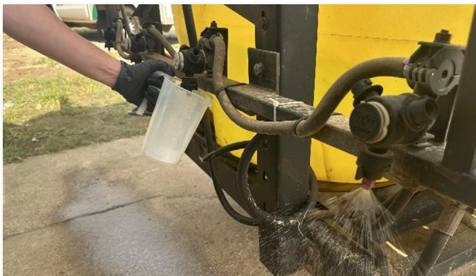
Figure 1. Catch test on a boom nozzle using a catch container.