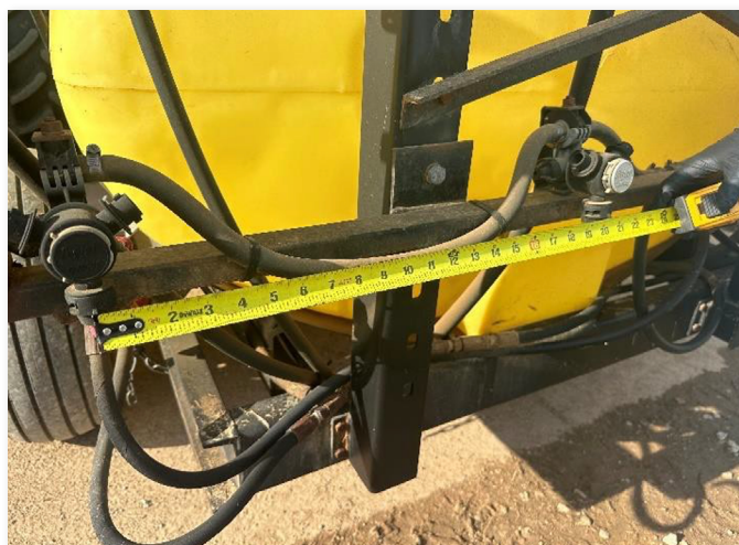
Figure 2. Catch test on a boom nozzle using a catch container.

Simultaneously, start to catch all the flow from a single nozzle and start the stopwatch. Ideally, catch the flow for one-minute and repeat for each nozzle on the boom. Make sure that all nozzles have a flow rate that is within 10% of the average of the entire boom. It can be helpful to write down each reading to both determine the average flow rate, as well as those that deviate more than 10%. If an individual nozzle has a flow rate lower than 10% of the average flow rate, check to ensure that it is the same nozzle size and that it does not have an obstruction. If an individual nozzle has a flow rate higher than 10% above the average flow rate, check that it is the same size as the rest of the nozzles. If so, it is possible that it is worn out and needs to be replaced.