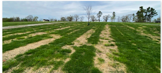
Figure 5. Skips caused by inadequate overlap.

which may lead to strips of poor control (Figure 5). Straking can be avoided by overlapping the swaths by a minimum of 30 percent. Use the effective swath width for calibration.