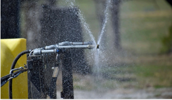
Figure 1. 180° spray pattern of boom-less nozzle.

performing catch tests should be completed using water alone.