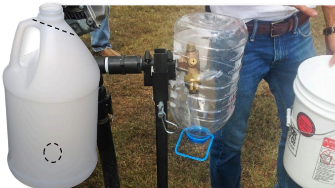
Figure 2. (left) Deflector used in catch test. Figure 3. (right) Secure deflector to nozzle.