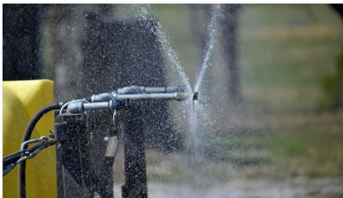
Figure 1. 180° spray pattern of boom-less nozzle.

performing catch tests should be completed using water alone.