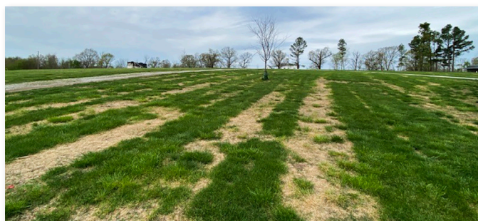
Figure 5. Skips caused by inadequate overlap.

which may lead to strips of poor control (Figure 5). Striking can be avoided by overlapping the swaths by a minimum of 30 percent. Use the effective swath width for calibration.