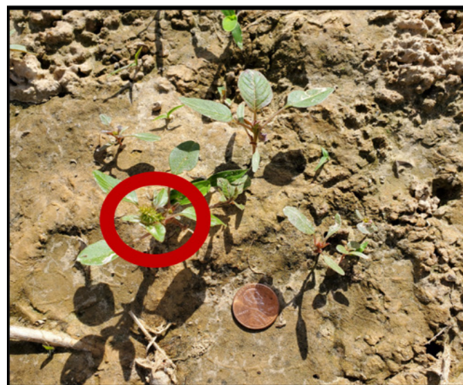
Figure 5. Palmer amaranth emerging in Rohwer, AR on October 12, 2019. A seedhead is forming (circled in red) on a plant less than two inches tall.