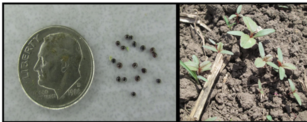
Figure 1. Seeds (left) and seedlings (right) of Palmer amaranth.