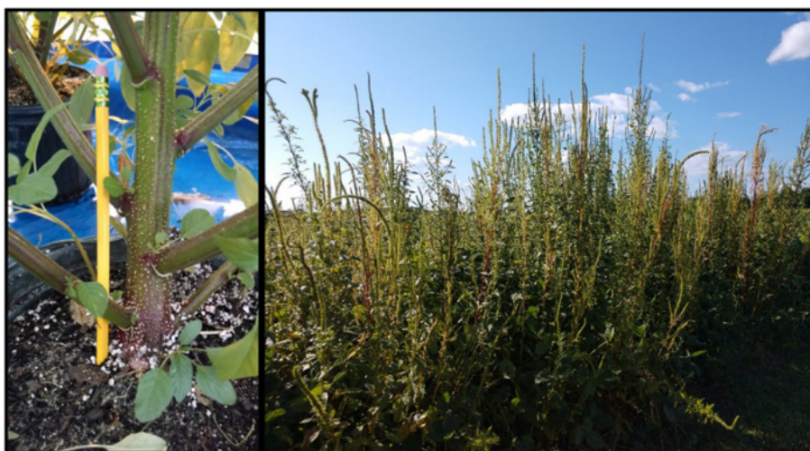
Figure 3. Palmer amaranth stem size (left) and invasiveness in a soybean production field (right).

and increases the likelihood that transfer of herbicide-resistant genes occurs. Viable Palmer amaranth pollen was identified as traveling up to 1,000 feet from its source plant (Ward et al. 2013). Additionally, Palmer amaranth has caused yield reductions of 91%, 60%, and 79% in corn ( Zea mays L.), cotton ( Gossypium hirsutum L.), and soybean ( Glycine max L. Merr.), respectively, if left uncontrolled (Bensch et al. 2003, MacRae et al. 2013, Massinga et al. 2001).