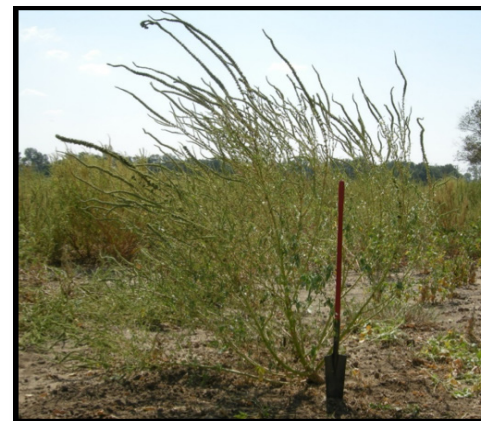
Figure 2. Single female Palmer amaranth plant that produced 1.8 million seeds.

rates (up to 2.5 inches per day) and efficiency in high-irradiance environments (Ward et al. 2013). Specifically, Palmer amaranth exhibits increased height, biomass, leaf area, and branching compared to other pigweed species, leading to its superior invasiveness (Figure 3) (Horak and Loughin 2000). Palmer amaranth is also a dioecious weed species (separate male and female plants) (Steckel 2007), which ensures cross pollination