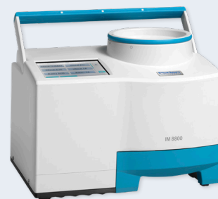
Figure 5. Perten Inframatic 8800 NIR