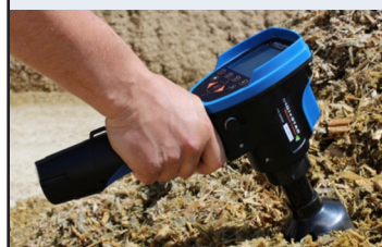
Figure 6. Digistar Moisture Tracker