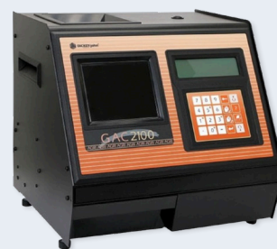
Figure 3. DICKEY-john GAC 2100