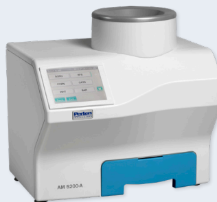
Figure 4. Perten AM 5200-A