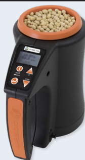
Figure 2. DICKEY-john Mini GAC® 2500