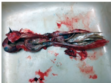
Figure 5. The esophagus, crop and gizzard of a lesser scaup collected on an Arkansas baitfish farm. The fish inside the esophagus and crop are golden shiners.

Additionally, fish that are not caught and consumed by lesser scaup can be injured by them. These fish typically have scars that appear on their sides or have missing scales. The mechanical damage caused by avoiding predation to lesser scaup can lead to bacterial or fungal infections in the fish, some of which can result in substantial losses.