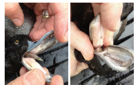
Figure 3. Lesser scaup collected on an Arkansas baitfish farm in the act of consuming fathead minnows. On the right, the tail of a fathead minnow is sticking out of the duck's mouth. On the left, the head of a fathead minnow can be observed.

A follow-up study by UAPB Extension and USDA/APHIS Wildlife Services personnel was conducted in 2014 to estimate the number of baitfish consumed by lesser scaup (Roy et al. 2014). The study revealed that fish and fish parts (bones, scales and otoliths) were identified in 41 percent of the lesser scaup examined (Figure 3). Fish were second only to snails,