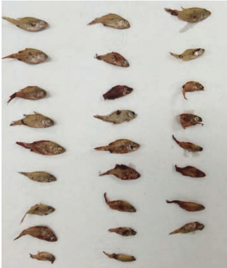
Figure 4. Twenty-six centrarchids removed from the esophagus and crop of a lesser scaup on an Arkansas sportfish farm in central Arkansas.

which occurred in 42.7 percent of the lesser scaup examined. A similar study conducted on sportfish ponds in 2015 revealed that 82 percent of the lesser scaup examined had fish as part of their diet (Figure 4 and 5). These studies show that lesser scaup consume considerably more baitfish than originally thought.