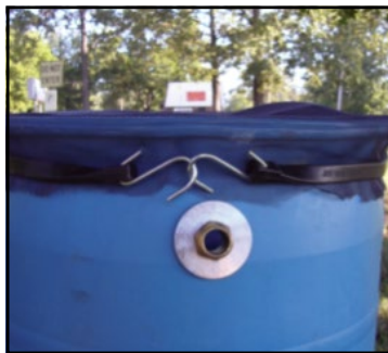
Screen fastened to top.

to cut the downspout. Disconnect the elbow at the bottom of your downspout. Hold the disconnected elbow up to the downspout to mark where to cut the downspout to provide at least 2 inches between the elbow and the rain barrel so the barrel can be easily removed for future maintenance. Cut the down spout at the line and reconnect the elbow to the downspout.