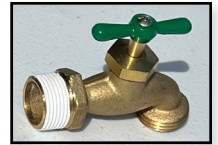
Spigot stem wrapped in plumber tape.

Step 1: Preparation. Mark all cuts and holes to be drilled on your clean 55-gallon barrel. The overflow hole can be located on either side of the barrel and should be at least 2 inches from the top edge of the barrel. The spigot hole should also be 2 to 3 inches from the bottom edge of the barrel.