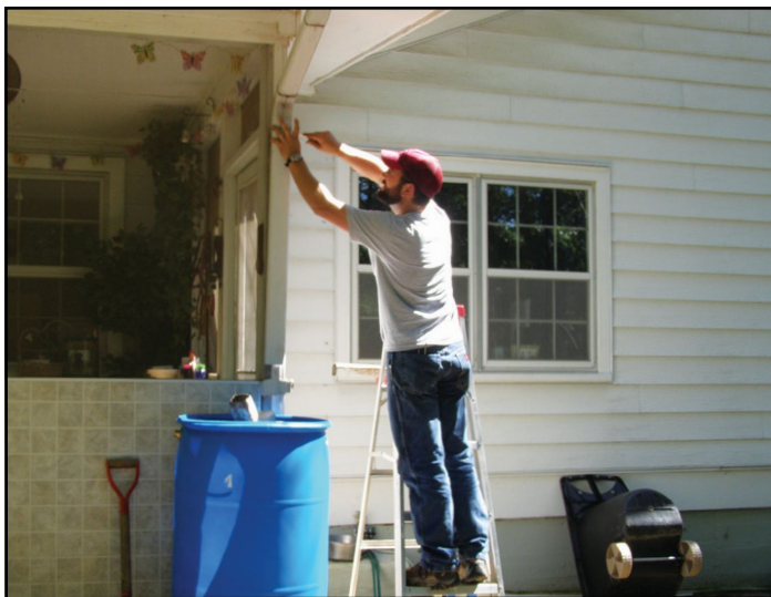
Outfitting rain barrel to house.