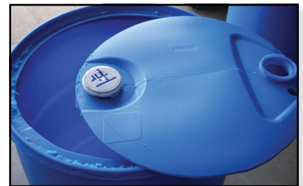
Barrel with top cut out.

Step 2: Cutting and drilling. Drill a 1" pilot hole in the top of the barrel to start your saw blade and cut the top out of the barrel using a jig saw or reciprocating saw. Make sure to leave at least a 1" rim to secure the fiberglass screen later. Next, drill the overflow hole at the top of your barrel with a 1" drill bit. Then drill the spigot hole using a 1 ½" hole bit. Use a utility knife to smooth out the plastic burrs around all holes and cuts. Finally, clean the inside of the barrel to remove plastic shavings.