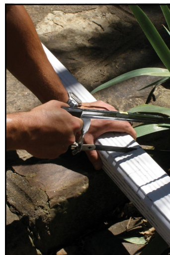
Making the gutter cut for new elbow placement.