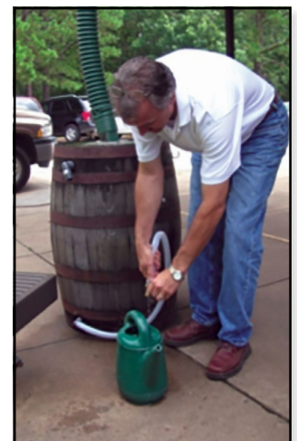
Rain barrel placed without a stand will have reduced water pressure.