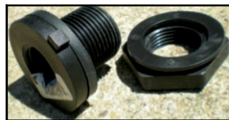
Bulkhead tank fitting.