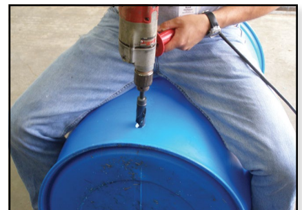
Drilling overflow hole.

Step 3: Inserting fixtures and fittings. Insert the bolt-shaped end of the bulkhead tank fitting into the barrel from the inside, keeping the rubber gasket between the "bolt" and the inside of the barrel. The plastic washer fits between the outside of the barrel and the nut of the tank fitting. These fittings have left-handed threads, so tightening seems backwards. Wrap the spigot stem in plumbers tape and insert it into the bulkhead