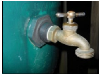
Spigot attached to a bulkhead tank fitting.

Once you know the height of the barrel, it is time