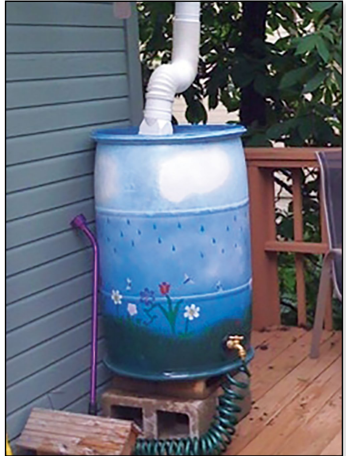
Painted rain barrel on stand with flexaspout attachment.

to cut the downspout. Disconnect the elbow at the bottom of your downspout. Hold the disconnected elbow up to the downspout to mark where to cut the downspout to provide at least 2 inches between the elbow and the rain barrel so the barrel can be easily removed for future maintenance. Cut the down spout at the line and reconnect the elbow to the downspout.