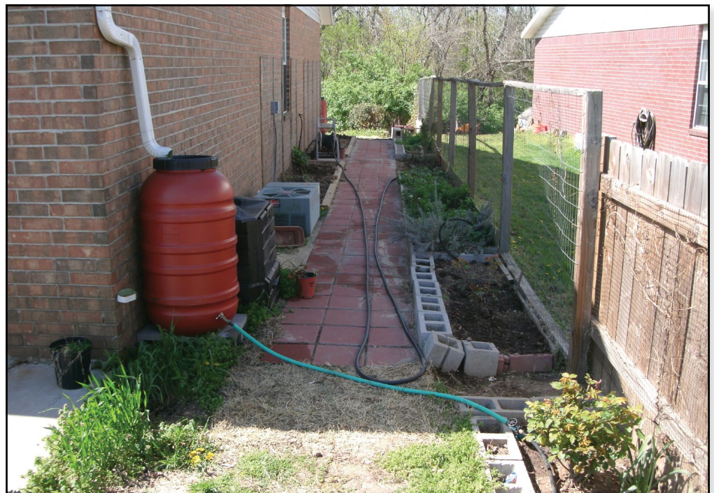
Rain barrel with soaker hose attachment leading to a flower bed.

Visit our website at: https://www.uaex.uada.edu