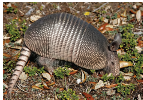
Figure 1. Armadillos are protected by armored scutes that cover most of their body.

Armadillos have poor eyesight but a keen sense of smell used to hunt their prey. Seventy-five to ninety percent of their diet is invertebrates, primarily beetles and their larvae.