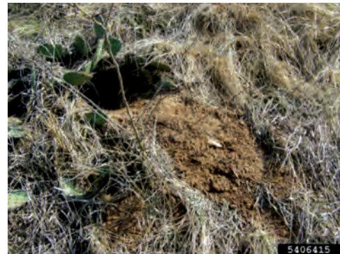
Figure 4. Burrow entries for armadillos are typically 7 to 8 inches in diameter.