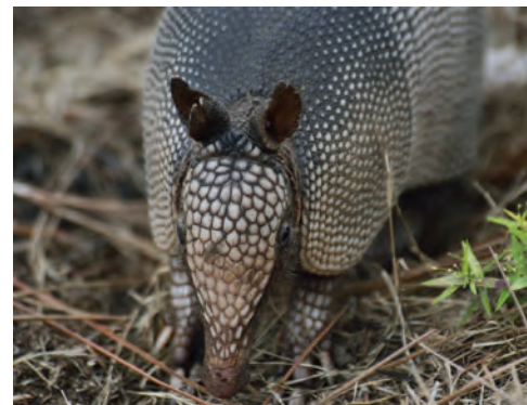
Figure 2. Armadillos have a keen sense of smell to detect underground invertebrates and dig with specialized claws.

In every season except winter, they consume beetles, grubs, spiders, centipedes, millipedes and earthworms. In winter, their diet shifts to fly larvae. They occasionally consume fleshy fruits or vertebrates (mostly small reptiles and amphibians), eggs of ground nesting birds and maggots and pupae in carrion.