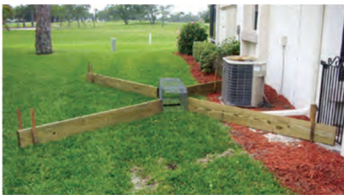
Figure 8. Boards can be used to funnel armadillos into cage traps.

Trap placement is key. Place a trap in an armadillo's natural pathway or burrow entrance. A trap's effectiveness can be enhanced by placing "wings" of 1 × 4 inch or 1 × 6 inch boards about 6 feet long (or other old boards, garden fencing, cinder blocks or other repurposed barriers) to funnel the animal into the trap entry (Figure 8). Permanent barriers such as an existing fence or edge of a building can also guide the armadillo into the trap.