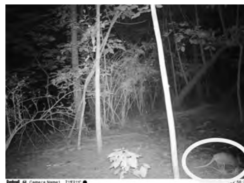
Figure 6. Trail cameras can help determine what creature might be digging holes.