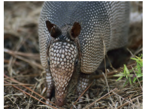
Figure 2. Armadillos have a keen sense of smell to detect underground invertebrates and dig with specialized claws.

In every season except winter, they consume beetles, grubs, spiders, centipedes, millipedes and earthworms. In winter, their diet shifts to fly larvae. They occasionally consume fleshy fruits or vertebrates (mostly small reptiles and amphibians), eggs of ground nesting birds and maggots and pupae in carrion.