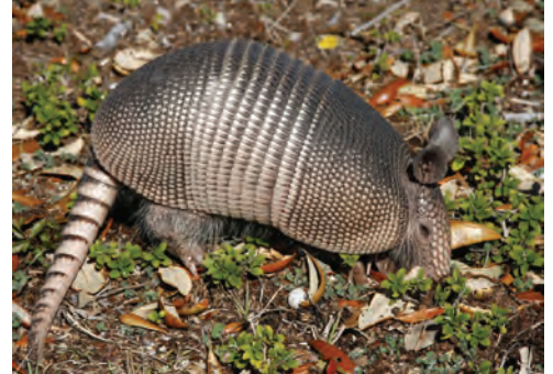
Figure 1. Armadillos are protected by armored scutes that cover most of their body.

Armadillos have poor eyesight but a keen sense of smell used to hunt their prey. Seventy-five to ninety percent of their diet is invertebrates, primarily beetles and their larvae.