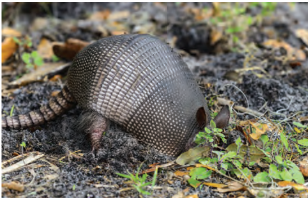
Figure 7. Armadillos dig for food, much to the consternation of those striving for a perfect lawn or garden.

Armadillos can keep people awake at night when rubbing their shells against houses or other structures.