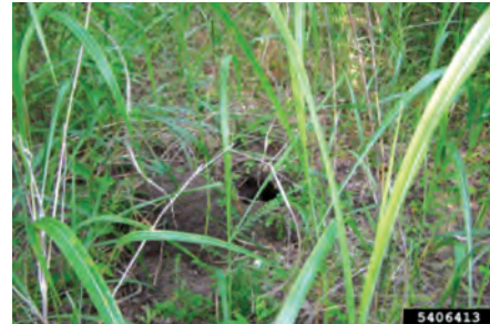
Figure 3. A small hole 1 to 3 inches deep and 3 to 5 inches wide is evidence of armadillo activity.

damage (Figure 6). Typically, armadillos are nocturnal during warmer temperatures and crepuscular (active in early morning and late evening) during moderate temperatures. They shift to daytime foraging during the warmest part of the day in midwinter.