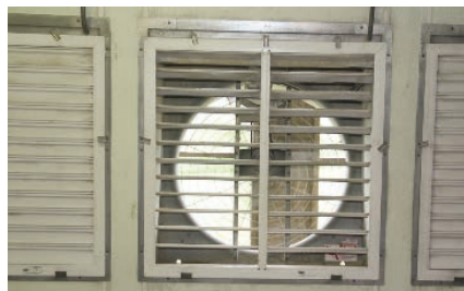
Frequent fan cleaning will reduce air flow resistance.

wear. A worn belt that rides slightly lower in a pulley is similar to using a pulley that is ½ inch smaller in diameter. A smaller-diameter fan pulley results in low rpm of fan blades. How can you tell a worn fan belt?