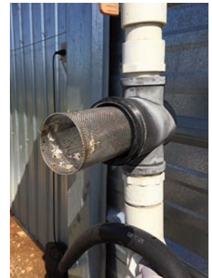
The water filter of the distribution system.

Check the mesh size of your filter. The larger the mesh size, the finer the mesh. You may want to decrease your mesh size to a 20 or a 12 in order to reduce pressure head.