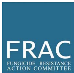
FIGURE 2. Fungicide Resistance Action Committee (FRAC) logo

have a high probability for fungal resistance to develop if they are misused. Sometimes a fungus that develops resistance to one active ingredient may also be resistant to other similar active ingredients. This situation is known as cross-resistance, and FRAC codes categorize products together that have closely related modes of action. For example, all fungicides with strobilurin chemistries will belong to FRAC code 11, and those belonging to the carbamate group belong to FRAC code 28.