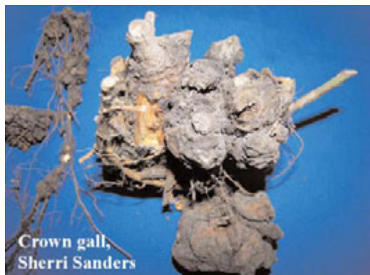
Crown gall, Sherri Sanders

Symptoms. Swellings or galls may form above ground on stems or branches or below ground on roots. The galls are usually rounded with a rough surface and a spongy texture and may darken and crack with age (photo). The galls can be confused with galls made by insect or mites and also by physiological responses to wounding or grafting. However, the interior of the gall caused by an insect will have chambers or cavities where the insect developed. The interior of a gall due to crown gall will have a mass of disorganized vascular tissue. It is often necessary to isolate the bacteria through diagnostic methods in order to make a positive identification. The effect that crown gall may have on a plant ranges from little to no impact on the growth and production to declining plant vigor or even death. The disease has a greater impact on young plants and is of great concern to the nursery industry.