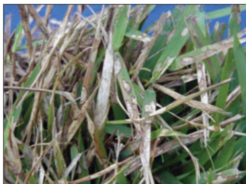
Figure 1. Rhizoctonia leaf lesions

On tall fescue, symptoms are readily recognizable on the leaves as straw-colored lesions with a dark brown edge ( Figure 1 ). Under optimum weather conditions, these lesions expand to kill the entire leaf. Diffuse olive-green circular patches of