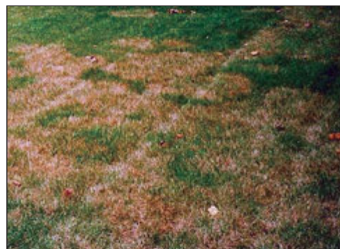
Figure 2. Brown patch in tall fescue

declining turf can occur following infection. Over time, grass in the interior of these patches starts to recover, producing a “smoke ring” appearance ( Figure 2 ).