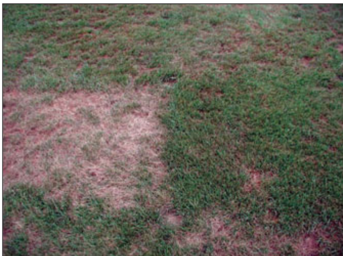
Figure 4. Visible differences between brown patch tolerance among two tall fescue cultivars