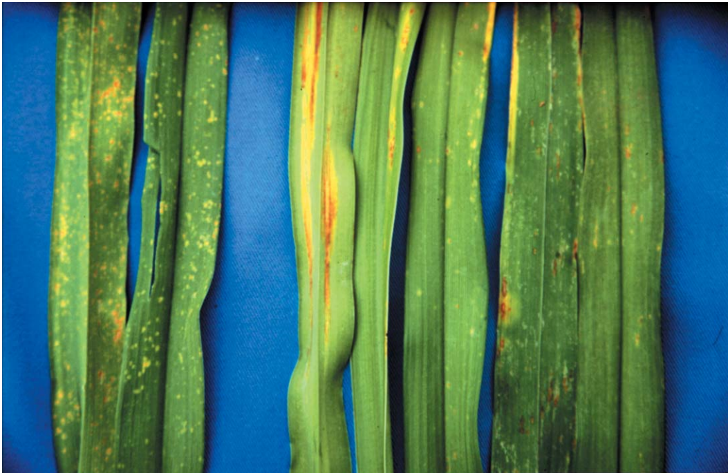
Daylily rust symptoms (2 left leaves)