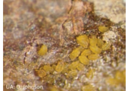
Figure 1. Root form of grape phylloxera on a grape root

In early April, eggs on the trunk hatch into first-generation yellow crawlers. These crawlers move to grape shoots to feed on the first to third expanding terminal leaves of the season. The leaf forms a gall around each crawler (Fig. 4, inside). The first generation crawlers usually form less than five galls per leaf (Fig. 4). During April and early May, each crawler matures into a fundatrix or stem mother (center of Fig. 5, inside). Each stem mother produces a second generation of 100 to 300 oblong,