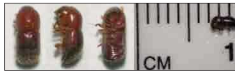
THE GRANULATE AMBROSIA BEETLE Xylosandrus crassiusculus (Motschulsky), Coleoptera, Curculionidae

Granulate ambrosia beetles have many reported hosts. Among the most common are red maple, redbud, styrax, ornamental cherry, pecan, peach, plum, cherry, persimmon, Japanese maple, golden rain tree, dogwood, sweet gum, Shumard oak, Chinese elm, magnolia, fig and azalea.