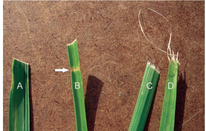
Figure 2. Leaf blade A demonstrates what a leaf blade should look like after mowing. Leaf blade B demonstrates a leaf blade injured by a dull mower blade. Leaf blade C was cut by the mower, but its condition indicates that the mower blade was not sharp enough. The white tissue sticking out of the leaf blades (C and D) is the vascular tissue of the plant. Leaf blade D was mown for quite some time with a dull mower blade.

Sharply-cut leaf blades increase turf health by improving recovery, decreasing water loss and increasing photosynthesis (Figure 2). Lawns mown with a dull mower blade have poor aesthetics, heal more slowly and have greater water loss (Figure 3).