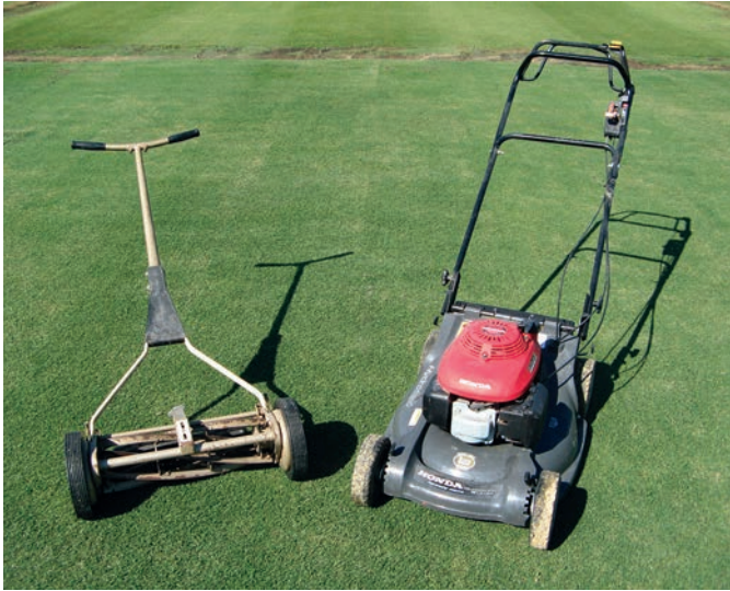
Figure 8. Reel and rotary lawn mowers.

There are two main types of lawn mowers used: reel and rotary (Figure 8). Reel mowers have many parts including a reel, bedknife and a roller (Figure 9). The grass blade is cut in a scissor-like