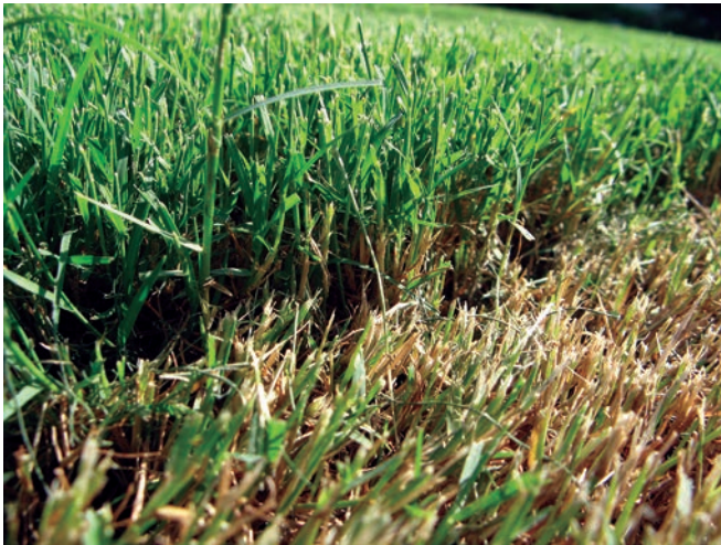
Figure 5. Up-close damage caused by scalping.