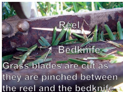
Figure 10. Grass blades are cut with a reel mower in a scissor-like fashion.

The disadvantages of reel mowers are 1) it is more difficult to adjust the height of the mower and 2) sharpening the mower (i.e., grinding the bedknife and backlapping the reel) is difficult and should be performed by someone with experience or training. Rotary mowers are by far the most popular type for homeowners, although self-powered reel mowers are gaining popularity.