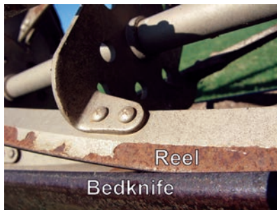
Figure 9. Reel and bedknife components of a reel mower.

fashion when the leaf blade is pinched between the reel and the bedknife (Figure 10). The metal-to-metal contact between the reel and the bedknife is lubricated by the water inside the grass blades as they are cut. Reel mowers provide a more precise cut and are used in high-quality areas such as golf courses. Scalping is typically less common with reel mowers than rotary.