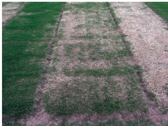
Figure 7. The benefits of an early spring mowing to remove dead leaf tissue are illustrated in this picture. From left to right, the spring mowing heights were 0.5, 1.0 and 1.5 inches on this turf that was maintained the previous year at 1.5 inches.

Before bermudagrass and zoysiagrass begin to grow in the spring, mow the turf slightly shorter than normal to remove dead leaf blades and other debris. This practice will reduce shading of the emerging plants and also serves to warm soil temperatures more quickly in the spring. The result is a lawn that greens-up more quickly in the spring (Figure 7). The risk in this practice is that you could scalp some of the emerging grass if this practice is delayed until after the lawn has begun to green-up. Carefully inspect the turf before removing dead leaf tissue and debris to ensure there are no green shoots emerging. Zoysiagrass lawns often do not go fully dormant like bermudagrass during winter. Therefore, this practice is likely to be more damaging on a zoysiagrass lawn than a bermudagrass lawn. Low mowing in early spring is damaging to centipede-grass and St. Augustinegrass lawns since they spread by aboveground stems (stolons) and are more prone to injury from this practice.