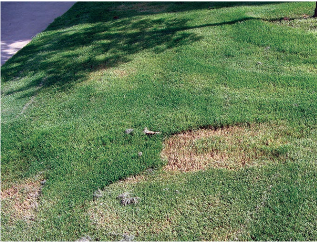
Figure 4. Scalping caused by a rotary mower on hybrid bermudagrass.