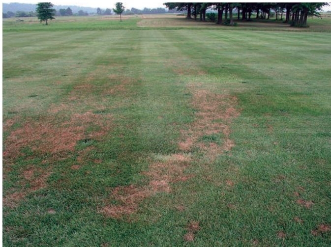
Figure 6. Disease can be spread by mowing equipment when grass is wet.

Lawns are best mown when the turf is dry. Clippings are more easily distributed on a dry lawn because they don't bunch up or clog mowers. Disease organisms are more easily spread in wet turf, and fresh-cut leaf blades offer a point of entry for infection (Figure 6). Wet turf is more easily torn from the ground during mowing by equipment when the soil is wet. Lastly, it is safer to mow when the lawn is dry because there is less risk of slipping and being injured by the mower.