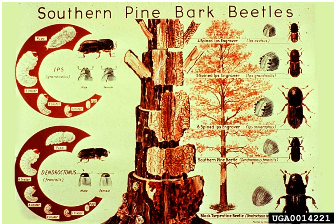
Figure 10. The five species of bark beetles native to Arkansas forests.

Artwork courtesy of Southern Forest Insect Work Conference, Bugwood.org