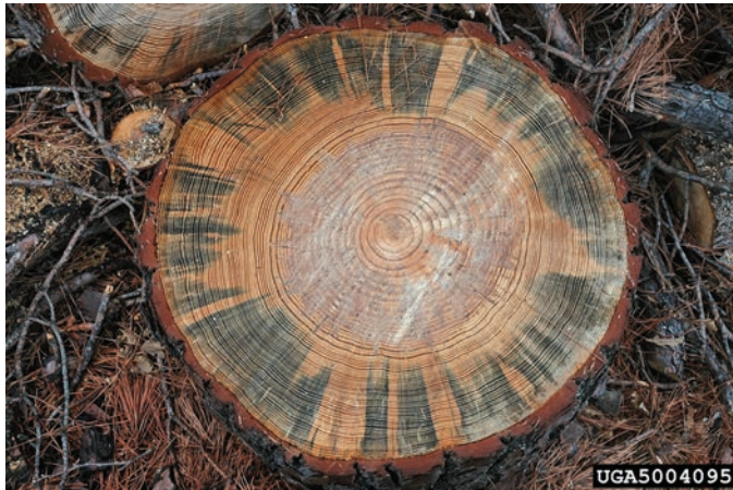
Figure 4. Blue stain fungi can be carried by several bark beetle species.