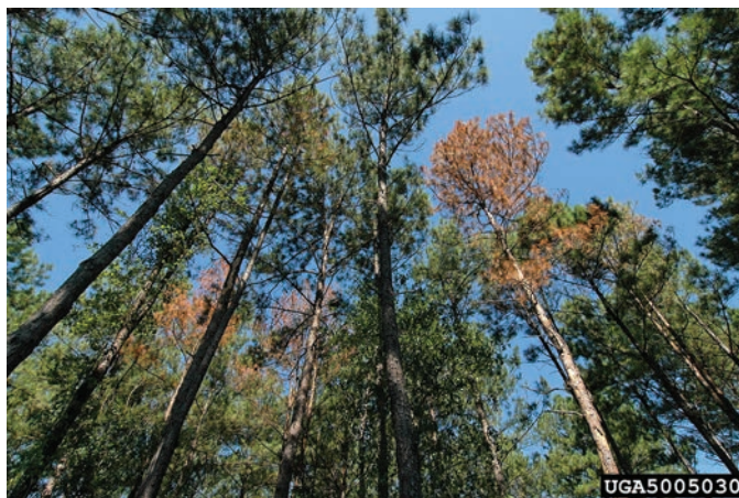
Figure 18. Ips often kill scattered trees or scattered branches within a tree.

Because Ips beetles seldom create large spots of dead trees, the treatment for these attacks is different than that of SPB. Usually Ips infestations occur on single trees or small groups of trees scattered throughout a pine stand (Figure 18). This makes the use of buffers around infected trees unnecessary in most instances. If enough trees are infested within a stand, then a salvage of infested trees can be economically viable. However, if there is extreme drought or some other severe stressors predisposing the trees to attack, then logging damage to residual trees can cause the Ips beetle infestation to spread. These salvage operations should be conducted in the late fall or winter when the insects are not active. During the late fall and winter, reduced sap flow in pines makes trees damaged during the harvesting operation less attractive to Ips beetles. Because the two smaller Ips beetles infest the tops and limbs, care should be taken during salvage operations to make sure tops and limbs that remain are not left next to healthy trees. Leaving them next to healthy trees can give the Ips beetles an opportunity to move from the infected top into the adjacent healthy trees.