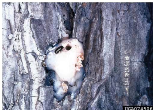
Figure 2. An adult bark beetle stuck in pine resin.

Southern Pine Beetle ( Dendroctonus frontalis Zimmermann) is the most well-known, and the most destructive, of Arkansas' native pine bark beetles (Figure 2). These insects attack pine trees that have been stressed, usually from drought or overcrowding, and can kill the attacked trees in two ways. First, the beetles construct galleries through the inner bark of the tree to lay eggs (Figure 3). After the eggs hatch, the beetle larvae cut galleries through the inner bark as they feed. If enough beetles attack the same tree, the galleries effectively girdle and eventually kill the tree.