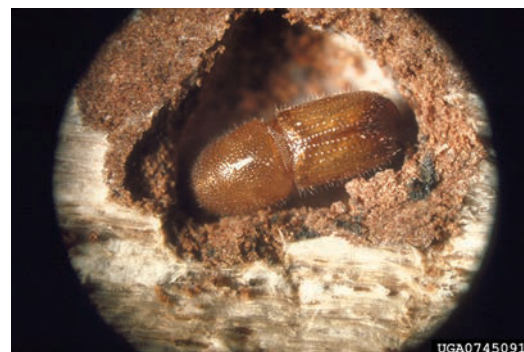
Figure 1. An adult bark beetle in a pine stem.