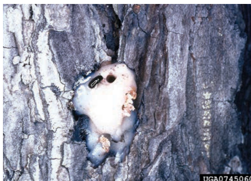
Figure 2. An adult bark beetle stuck in pine resin.

Southern Pine Beetle ( Dendroctonus frontalis Zimmermann) is the most well-known, and the most destructive, of Arkansas' native pine bark beetles (Figure 2). These insects attack pine trees that have been stressed, usually from drought or overcrowding, and can kill the attacked trees in two ways. First, the beetles construct galleries through the inner bark of the tree to lay eggs (Figure 3). After the eggs hatch, the beetle larvae cut galleries through the inner bark as they feed. If enough beetles attack the same tree, the galleries effectively girdle and eventually kill the tree.