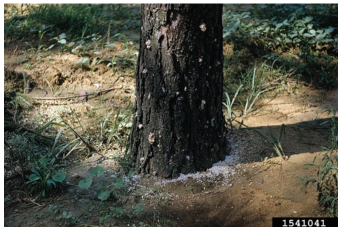
Figure 13. Frass and wood dust created by black turpentine beetles.

Black Turpentine Beetle ( Dendroctonus terebrans (Olivier)) is the largest of the pine bark beetles in Arkansas. They are approximately 1/5 to 3/8 inch long and black in color. Unlike other pine bark beetles, the black turpentine beetle (BTB) attacks scattered trees as a single insect or in very low numbers. They usually attack trees that have been stressed by a lightning strike, previous timber harvest damage, yard work damage, age or some type of environmental factor. Attacks by the BTB can kill trees over a period of months or years, though trees often survive the attacks. The BTB attacks a pine tree and spends a considerable time inside that tree. The beetles kick out frass and wood dust while occupying the tree (Figure 13). This causes the pitch tubes to be reddish or pinkish colored (Figure 14), making them easier to distinguish from the pitch tubes of the other bark beetles. The BTB is typically found in the lower 8 feet of the tree, most commonly in the lower 2 feet. Their feeding and egg laying activities differ from that of the Ips or SPB. BTB produce large round galleries in the inner bark (Figure 15) instead of linear galleries. BTB larvae feed in groups rather than as solitaire larva like Ips larvae and SPB larvae.