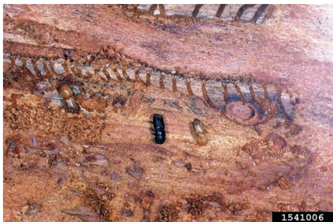
Figure 9. An adult Ips engraver beetle.

There are three species of Ips bark beetles native to Arkansas (Figure 9). They are (1) the six-spined engraver ( Ips calligraphus Germar), (2) the five-spined engraver ( Ips grandicollis Eichhoff) and (3) the four-spined engraver ( Ips avulsus Eichhoff). They range in size from 1/8 inch for the small southern pine engraver to 1/5 inch for the six-spined engraver. The Ips beetles have a row of spines along each side of the posterior, hence the name six-spined, five-spined and four-spined. The three Ips beetles are