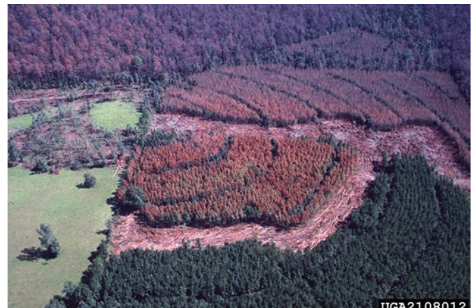
Figure 17. Spread of this beetle spot has been halted by the buffer strip. Salvage logging will begin soon.

the last infested tree must be cut. For example, if the infested trees are 50 feet tall, then the buffer strip must extend at least 50 feet past the last infested tree. Third, the uninfested buffer trees must be harvested immediately by the salvage logging crew (Figure 17). All trees in the buffer must be felled back toward the center of the SPB spot or dragged back to the center after felling to assure that any remaining infested trees will not introduce SPB into the uninfested region beyond the buffer strip. After felling the buffer strip, the logger should cut the remaining trees