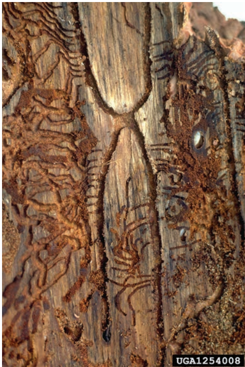
Figure 11. Ips beetles create galleries that are either “H” or “Y” shaped.

Artwork courtesy of Southern Forest Insect Work Conference, Bugwood.org