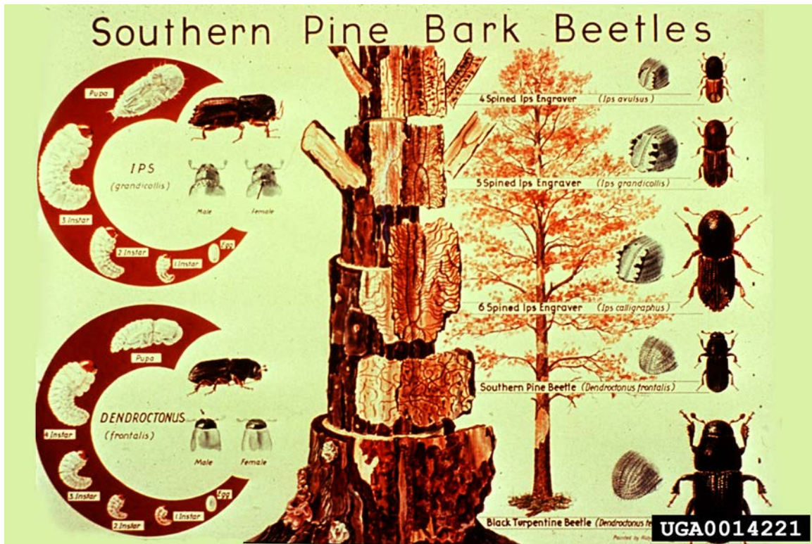
Figure 10. The five species of bark beetles native to Arkansas forests.

Artwork courtesy of Southern Forest Insect Work Conference, Bugwood.org