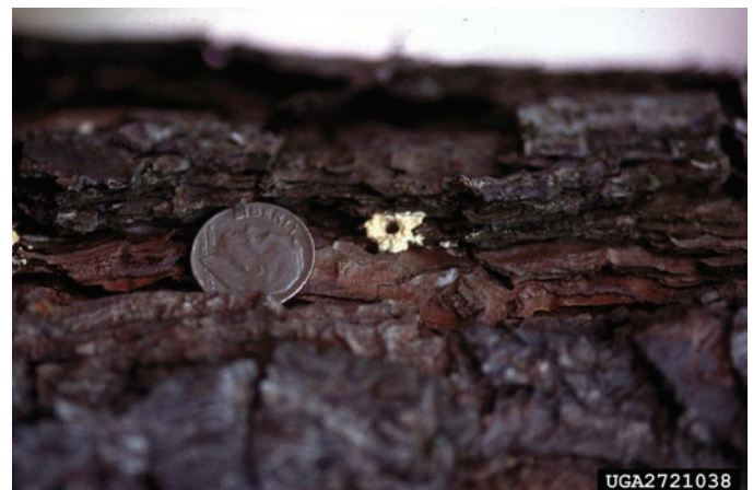
Figure 12. A pitch tube created by an Ips beetle.

Since some of the Ips beetles attack the crown of the pine tree, many times the needles on only one or a few limbs may fade to yellow and then to red, indicating an insect attack. However, like the SPB, if the larger Ips beetles attack the lower bole of the tree, then the entire crown may fade at the same time.