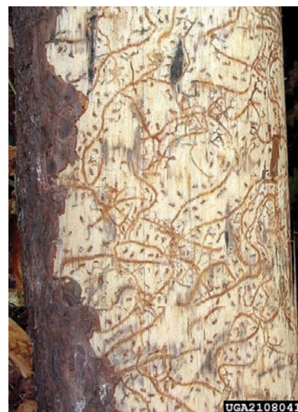
Figure 3. S-shaped galleries constructed by southern pine beetles.

Second, southern pine beetles (SPB) can introduce blue stain fungi (Figure 4) into the trees they attack. Blue stain fungi colonize the xylem (wood) and block the flow of water from the roots to the tree crown, which results in tree mortality. Even if the number of SPB adults and larvae infesting the tree is not sufficient to