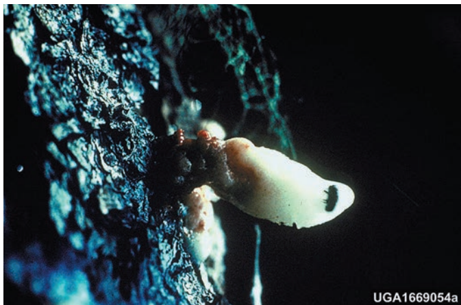
Figure 7. A pine bark beetle trapped in crystallized pine resin.

Pine trees have a natural mechanism to protect themselves from bark beetle attacks. They produce pitch, a sticky substance, which floods beetle galleries and drives the beetles out or encases them in crystallized resin (Figure 7). Often the pitch leaks out of the holes bored by beetles entering the tree and hardens into white or cream-colored globs called pitch tubes (Figure 8) that can look like popcorn kernels on the bole of the tree. Trees which are not stressed can oftentimes produce enough pitch flow to prevent successful bark beetle attacks. However, trees stressed by overcrowding or drought may produce little or no pitch, enabling a successful bark beetle attack.