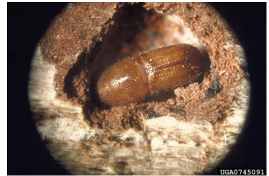
Figure 1. An adult bark beetle in a pine stem.

Arkansas forests are home to two native species of pine trees, loblolly pine ( Pinus taeda L.) and shortleaf pine ( Pinus echinata Mill.). We also have five species of native bark beetles (Figure 1) that attack and kill those pine trees. The bark beetles found in Arkansas are the Southern Pine Beetle, three species of Ips Engraver Beetles and the Black Turpentine Beetle.