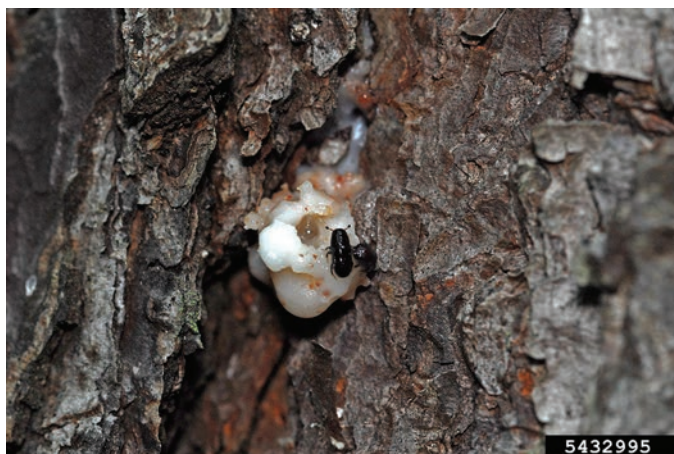
Figure 8. A pitch tube produced in response to a bark beetle attack.