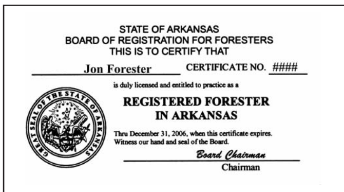
Figure 2. All foresters who practice for hire in Arkansas must be registered with the state Board of Registration.

State law requires that anyone who claims to be a forester for hire in Arkansas must be registered with the Arkansas Board of Registration for Foresters. Those who want to become registered foresters in Arkansas must complete a minimum level of education and experience. This assures that they can adequately serve the needs of Arkansas' woodland owners. Foresters who registered in Arkansas before 2001 will at least have had several years of professional experience prior to registration. Most will have a college degree in forestry. Foresters who registered in Arkansas after January 1, 2001, must have a college education and must pass a written test administered by the Arkansas Board of Registration for Foresters. To maintain registration, foresters are required to receive eight hours of continuing forestry education each year.