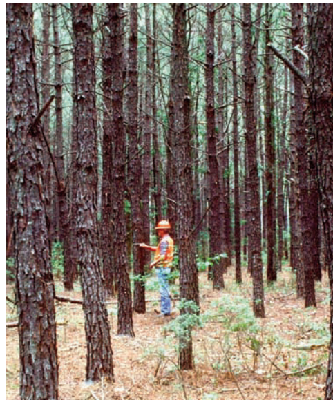
Figure 1. The professional forester is your expert on forestry matters.

A consulting forester is a professional forester who advises and watches out for the best interest of a woodland owner. Consulting foresters are in business, so they charge fees based on the type of service offered. Foresters sell some services at hourly or daily rates, while other services are sold at rates based upon acreage. Fees for conducting forest products sales are usually charged as a percentage of the gross revenue from the sale. No matter how the fees are calculated, the most important thing to remember is that the consulting forester works for the landowner . When you hire a consulting forester, that forester is your representative in