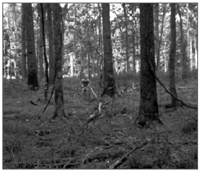
One of the series of cuts in a shelterwood harvest designed to promote oak regeneration.

There are several types of harvests that produce an even-aged stand. Two methods commonly used in the South include clearcutting and a shelterwood harvest. Clearcutting (removing all canopy trees in one operation) is often viewed negatively, because it can leave degraded stands. In many cases, this concept is true because the operation is not properly planned and implemented. In order for a clearcut harvest to be successful in regenerating upland hardwoods, two primary concerns must be met: (1) a substantial amount of desirable advanced regeneration (along with potential stump sprouts) must exist before the harvest, and (2) the harvest must remove all of the canopy trees. Often, clearcuts that focus only on low harvest costs and current stand value leave a significant amount of small-diameter, undesirable stems that make it difficult for desirable species, such as oaks, to regenerate and develop. However, if applied properly, clearcutting can be an excellent method for regenerating desirable hardwoods.