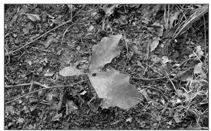
New seedlings lack the size to compete well after a harvest.

system or the proper size to compete for growing space after a harvest. Therefore, very few new seedlings will become established in a stand after a harvest.