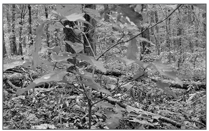
Larger advanced regeneration is a better competitor in harvested stands.

Site quality relates to soil productivity, which tells forest managers which tree species will perform best on a given forest site. Perhaps the most significant effect of site quality is its impact on the competition to be expected. Higher quality sites are not only more productive for desired oak regeneration, but also for the grasses, shrubs and undesirable tree species that are competitors. Therefore, higher quality sites will, as