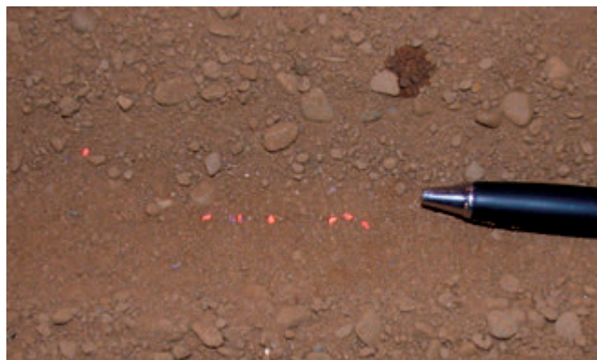
Figure 3. A small amount of painted seed added to the seed box can help determine seeding depth.

After calibrating the drill, plant test strips to determine the depth at which seed is being planted. Small seeds are difficult to see in the row. A small amount of seed can be spray painted bright orange and allowed to dry thoroughly, mixed with plain seed and placed in the drill seed box immediately above each seed outlet. The colored seed is easily seen in the row. (Note: Make sure the painted seed has dried completely before putting it in the drill. Otherwise it