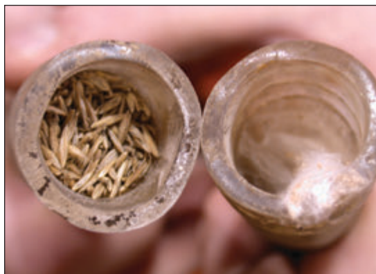
Figure 1. Seed tube on left plugged with old seed from a previous use and tube on right plugged with a spider web. All seed tubes should be checked for obstructions before each use to avoid skipped rows resulting from plugged tubes.

This method can be used to calibrate the drill before entering the field. Become familiar with the calibration mechanism on the drill before starting the calibration procedure. Some no-till drills have a single control meter for adjusting the seed flow from the seed box. Others have two control meters, one for each side of the seed box. In that case, the seed flow must be checked for both sides of the seed box. Because of equipment wear or uneven adjustment, it is common for each control meter to have a slightly different setting to deliver the same rate of seed.