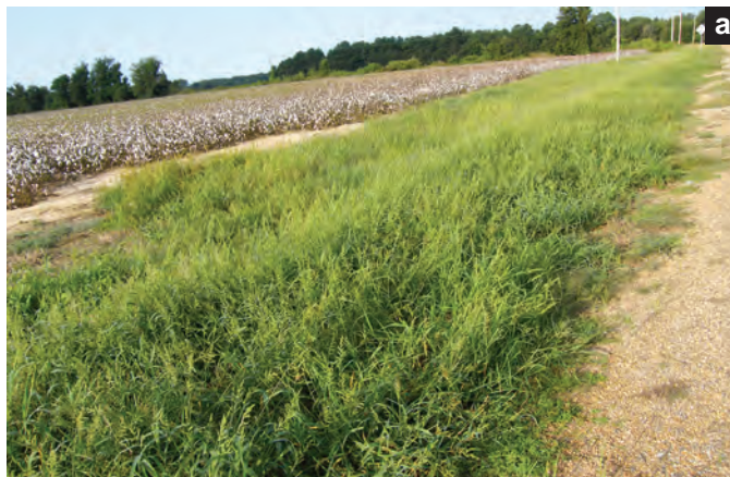
Figure 1 a-d. Occurrence of problematic weeds in (a) roadsides, (b) railroads and (c-d) other non-cultivated areas in the cropping region of eastern Arkansas.

A large-scale survey was conducted in 2012 across the Delta region in eastern Arkansas to understand the prevalence of resistance-prone weeds on the roadsides. It was found that Palmer pigweed, johnsongrass and barnyardgrass were some of the important resistance-prone weeds commonly found along the roadsides. Screening of the roadside Palmer pigweed samples revealed that >90% of the collected populations contained individuals that were resistant to both Roundup® and Staple® (Bagavathiannan and Norsworthy 2013). This is alarming because such levels of herbicide-resistant pigweed on the roadsides can result in the movement of resistance to crop fields that have never had a Palmer pigweed problem in them. It is very important to recognize that effective