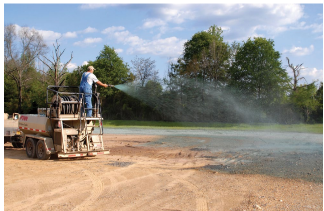
Figure 5. Arkansas lawn being established by hydroseeding.

Hydroseeding is the process where professionals apply seed in a water, fertilizer and mulch slurry (Figure 5). This process was developed in 1953 by Charles Finn in order to help establish turf on roadsides. This process is especially helpful in areas with difficult equipment access such as sloped areas. Wood- or paper-based products are typically used as a