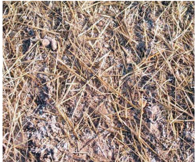
Figure 3. Straw should be applied lightly. Applying too much will shade out germinating seedlings.