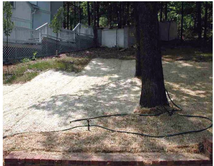
Figure 4. Various erosion control blankets can be used on slopes to help reduce erosion and retain soil moisture during establishment.

too much straw. Applying straw too thick can be detrimental to establishment and require removal after seedling germination. About 50 percent of the soil should be visible after mulching. There are many other erosion blankets available to help prevent erosion and increase soil temperature and moisture-holding capacity (Figure 4). These materials are often constructed out of jute, coconut fiber, excelsior, polypropylene and paper-based products. Some blankets are permanent, while others are to be removed after seed germination. Read and follow the manufacturer's instructions for best results.