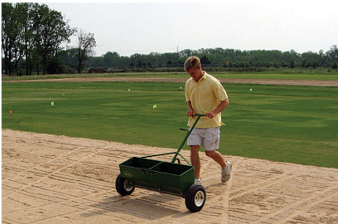
Figure 2. Seeding an area with a drop seeder.

While mulching is not essential for lawn establishment, it will help prevent erosion on sloped sites, conserve moisture and reduce seed loss from wind, birds and washing. Weed-free straw is a good choice for mulching. One square bale of straw typically covers 1,000 square feet (Figure 3). The tendency for most homeowners is to apply