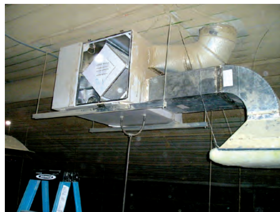
Figure 1. A heat recovery ventilator evaluated in a broiler house at the Applied Broiler Research Farm of the University of Arkansas. Picture shows the heat exchanger core, house air intake (with filter attached to duct) and fresh air intake duct from attic space (adapted from Liang et al., 2011).

different temperatures – (1) incoming fresh, cold air and (2) exhausted moist, warm air – into thermal contact, transferring heat from the exhaust air to incoming air during heating season (see Figure 1). The fuel spent in attaining the warm air can be reclaimed in this way. The heat recovery technology is a logical step to take before considering other renewable energy technologies. Because poultry barns are ventilated day and night, heat recovery systems can be operated and provide savings around the clock as needed.