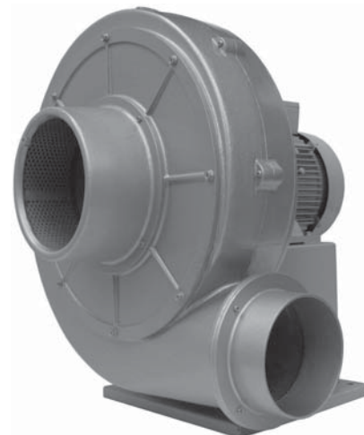
FIGURE 2. Centrifugal fan