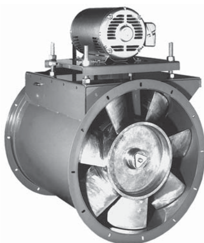
FIGURE 1. Axial flow fan

In axial flow fans, air moves almost parallel to the axis or impeller shaft. The impeller has a number of blades attached to a central hub. Axial flow fans can be divided into two types – propeller fans and vane-axial fans. Normally, propeller fans have two to seven long blades attached to a small hub. Propeller fan diameter is usually larger than its thickness.