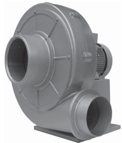
FIGURE 2. Centrifugal fan