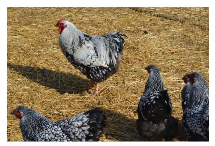
Figure 1. Silver Wyandotte, a Dual Purpose Breed.

Dual purpose poultry breeds are what most people think of as typical small family farm poultry. These birds will lay eggs and grow large enough and quickly enough to produce a bird suitable for home consumption. However, these breeds are not suitable for commercial enterprises. Additionally, these breeds will become broody to some extent. The dual purpose poultry breeds that produce eggs well will typically not become broody as often as those selected for growth. Most of these breeds have strains that will