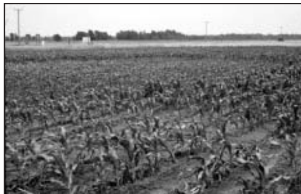
Poor drainage area in grain sorghum field.

Field surface smoothing and forming can improve the surface drainage of a field. Use land planes to smooth out the high spots and fill in the low areas so that the field has a more uniform slope toward drainage outlets. Low areas that are larger than 100 feet across or that require more than 6 inches of fill should be overfilled and compacted before being planed. Make an effort to accurately determine a field's drainage flow pattern. Deciding where water will drain by simply looking at the