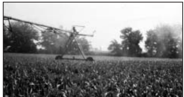
Center pivot irrigation on grain sorghum.

Pivots provide the ability to control the irrigation amount applied by adjusting the system's speed. This gives the operator advantages for activating chemicals, watering up a crop and watering small plants. It is also possible to apply liquid fertilizer and certain pesticides through the system. This is called chemigation, and it can be especially applicable to grain sorghum for sidedress or late-season applications of fertilizer. Any chemicals that are to be applied through the system