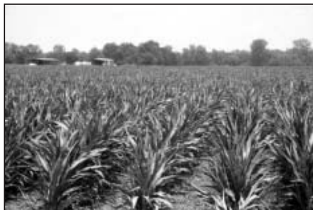
Grain sorghum showing signs of drought stress.

cases can result in crop failure. These potential risks are the basis for recommending irrigation of grain sorghum when possible.