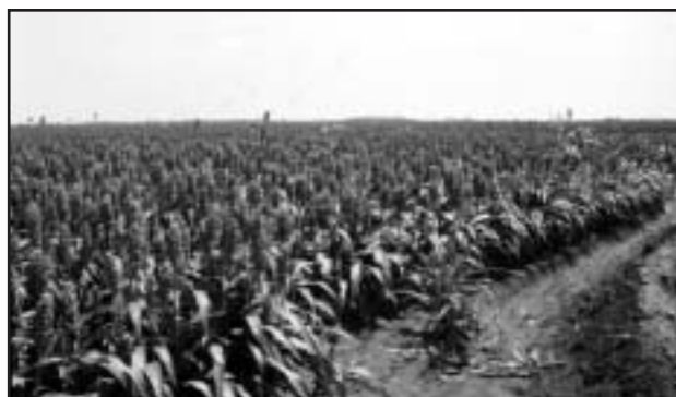
Levee irrigated grain sorghum field.

Flood irrigation with levees should really be thought of as flush irrigation. The challenge is to get the water across the field as quickly as possible. This is especially important if the grain sorghum is small and planted flat rather than on a raised row or