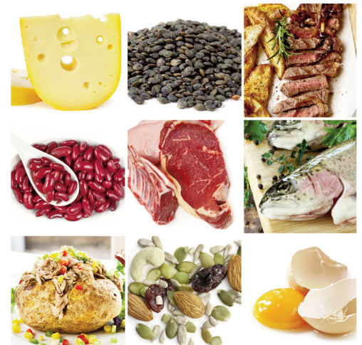
Food sources of protein, including cheese, lentils, red and white meat, kidney beans, fish, tuna, nuts and eggs.

Dietary protein quality is determined by its amino acid composition and its digestibility in the intestine. Animal sources of protein, such as poultry, lean beef, pork, fish and eggs, provide high-quality protein with all of the essential amino acids and are called complete proteins. Plant sources of protein, such as beans, nuts and seeds, contain inadequate amounts