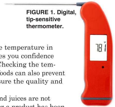
FIGURE 1. Digital, tip-sensitive thermometer.

horizontally from the side to avoid accidentally sticking the probe all the way through the meat. Taking the temperature in multiple places gives you confidence of proper cooking. Checking the temperature of grilled foods can also prevent overcooking and ensure the quality and experience. Color, texture, firmness and juices are not indicators of whether a product has been cooked to a safe temperature. Checking the internal temperature is the only way to properly gauge safety.