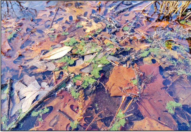
Figure 6. Under calm conditions Aphanizomenon sp. can form loose clumps at the surface of the water.

red, and might have a paint-like appearance (Figure 7) or look like a foam, mat or a scum. Sometimes a visible surface indicator may not be present and the HAB will look like water that is very green or opaque in appearance. As cyanobacteria in a bloom die and release toxins, the water may taste or smell bad.