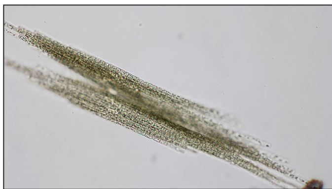
Figure 5. Aphanizomenon sp. under the microscope. Aphanizomenon trichomes (cells) will group together that can take on the appearance of grass clippings when viewed by the naked eye.

While a single cyanobacterium will be invisible to the human eye without a microscope (Figure 5), a bloom will likely become noticeable (Figure 6). The HAB might be blue-green, green, yellow, white, brown, purple or