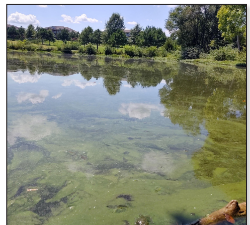
Figure 3. Cyanobacterial bloom dominated by Microcystis sp. in a small pond in Fayetteville, Ar.

water. Often, stimulating a phytoplankton bloom is desired, either to retard the growth of unwanted submersed plants and/or to provide food for larval fish by acting as the base of the pond’s food chain. Just because a water body is green doesn’t necessarily mean it has phytoplankton capable of producing toxins. When a cloudy green color is not desired, the bloom has become a nuisance algal