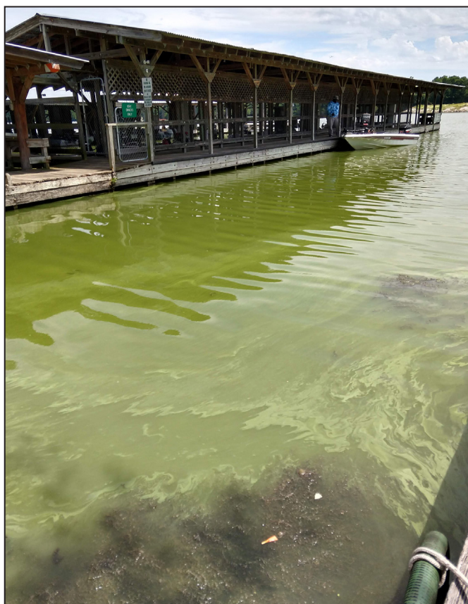
Figure 8. Microcystis sp. bloom at Lake Fayetteville, AR. Windy conditions can mix surface waters causing the lake water to take on a pea soup appearance.

The science of HAB control is still evolving, and