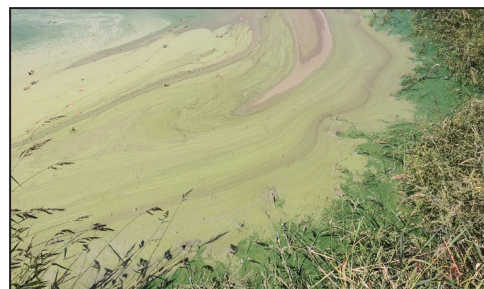
Figure 1. An algal bloom in a pond.

Some phytoplankton, especially cyanobacteria, thrive in nutrient rich