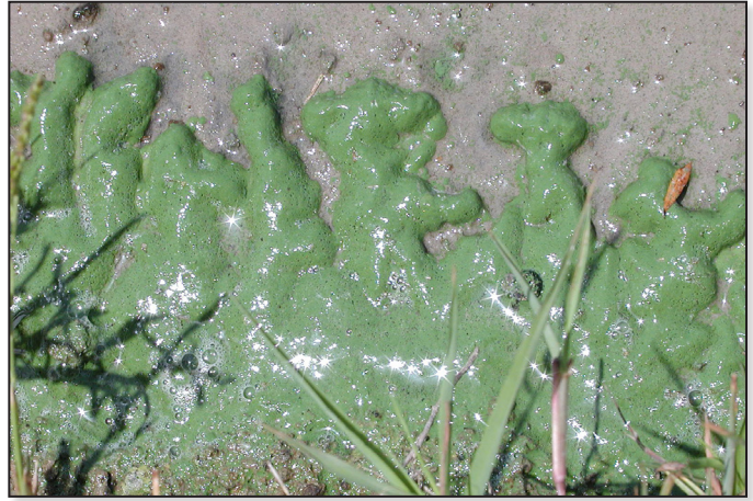
Figure 7. A foamy, scummy, paint like appearance is an indication to stay away.

Most factors that can lead to excessive blue-green algae blooms are known and predictable, and it is possible to take steps that can reduce their occurrence. To reduce HAB occurrence, the best option is to practice watershed protection by limiting or preventing nutrients from entering any water body, including ponds, ditches, streams, bayous, rivers, lakes or oceans. Establishing best management practices, such as basing fertilizer applications on soil test recommendations, properly