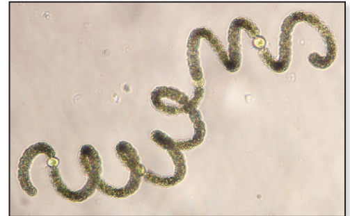
Figure 2. Anabaena sp. under the microscope. Anabaena in the water column tends to be solitary, with strands of cells taking on the appearance of pearls on a string.

water. Often, stimulating a phytoplankton bloom is desired, either to retard the growth of unwanted submersed plants and/or to provide food for larval fish by acting as the base of the pond’s food chain. Just because a water body is green doesn’t necessarily mean it has phytoplankton capable of producing toxins. When a cloudy green color is not desired, the bloom has become a nuisance algal