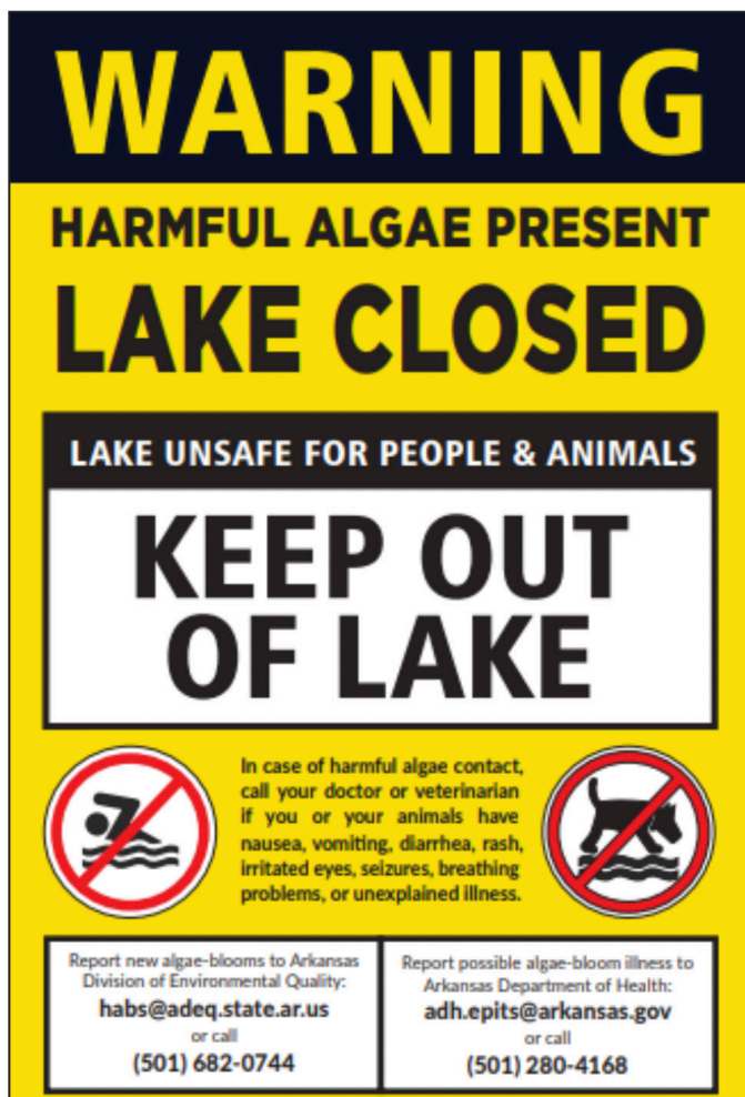
Figure 9. An example lake closure sign from the Harmful Algal Bloom Response Plan.

treatment approaches will vary by waterbody, and associated water uses. In general, the best way to treat a HAB is to decrease their likelihood by preventing excessive nutrients from entering waterbodies.