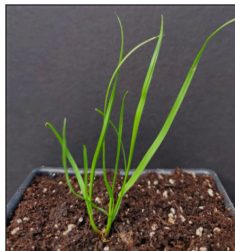
Figure 1. Italian ryegrass seedling.

Italian ryegrass appears very similar to perennial ryegrass ( Lolium perenne L.). It may grow upwards of 2 to 3 feet tall. Plants will grow in a bunch form with many long, narrow, stiff leaves which are red near the base setting it apart from perennial ryegrass