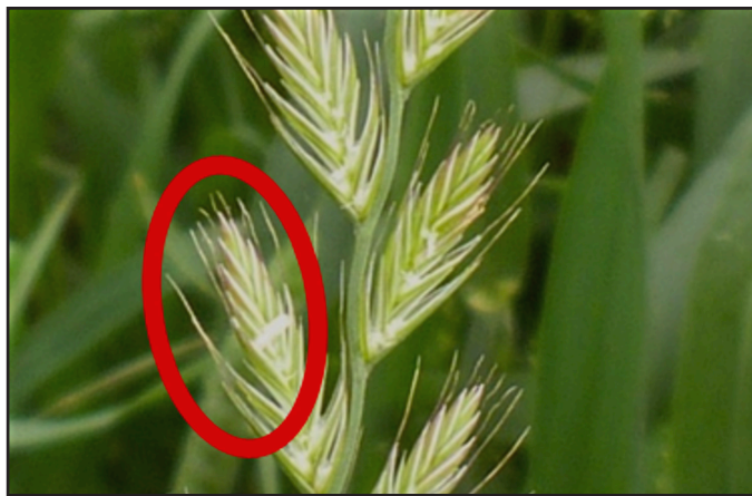
Figure 3. Closeup of spikelets on an Italian ryegrass seed head. The circled area shows the characteristic awns on a spikelet.