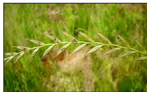
Figure 2. Italian ryegrass seed head with alternating arrangement of spikelets.

(Fig. 1). Leaf blades range from 3/16 to 7/16 inches wide and 2 to 8 inches long, with a bright, glossy, and smooth appearance (hairless) on the underside. The keys to identification of ryegrass species are the spikelets, awns and glumes. The seed head has 5 to 38 spikelets alternately arranged up the stem (Fig. 2). Italian ryegrass spikelets have awns or bristles about 3/16 inch