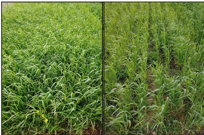
Figure 6. Example of the multiple herbicide applications necessary to effectively control Italian ryegrass in wheat. A single postemergence herbicide application applied in the spring (left) versus a residual herbicide applied preemergence in the fall followed by a postemergence herbicide applied in the spring (right).

Paraquat (3 to 4 pt/A dependent on formulation) is the most broad-spectrum herbicide option for control across cropping systems ahead of planting, especially in areas where Italian ryegrass is resistant to both glyphosate and ACCase-inhibitors, but it may require multiple applications. The addition of a photosystem II-inhibiting herbicide, such as metribuzin (soybean), diuron (cotton), or atrazine (corn), with paraquat can enhance ryegrass control. Use of propanil (rice) in combination with paraquat prior to planting rice does not greatly improve control, and again, sequential applications of paraquat are recommended in this scenario. Leadoff (1.5 oz/A) has also shown to be an effective tank-mixture partner with glyphosate in spring burndown applications for aiding