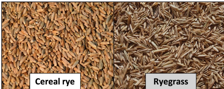
Figure 5. Comparison of cereal rye seed (left) versus ryegrass seed (right). Only cereal rye is recommended for use as a cover crop.

Ryegrass samples from fields with ryegrass control failures across various states in the US (primarily from the Mid-South and Southeast) showed