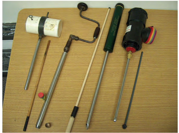
Figure 2. Hay coring samplers.

Feed costs can make up as much as 70 percent of your cost of raising livestock from birth to weaning. Feed inefficiency and waste can be significant contributors to your expenses. Most of your feed costs will occur when you are feeding hay or supplements to your animals during periods when your pastures are not available such as during winter, drought or floods. Producers often do not know the nutrient quality of the hay they feed, so they end up overfeeding or underfeeding their livestock. You can avoid this problem by having your hay tested. Hay samplers can be obtained through your local Extension office, and hay testing is provided for a