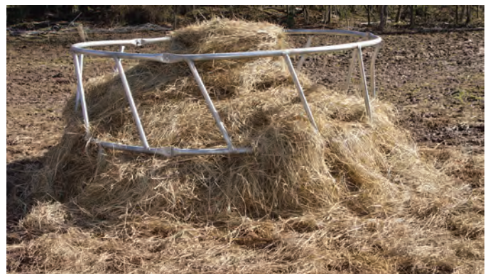
Figure 3. Hay pulled out of hay feeders and used as bedding is an easily corrected problem. Notice the difference between the hay loss from the feeder on the right compared to that of the feeder on the left.