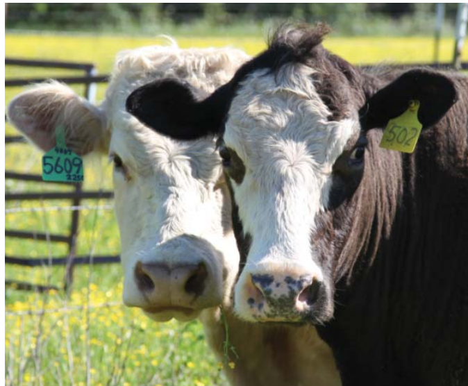
FIGURE 1. Examples of two numbering systems that can be used on ear tags. The white bull in the back is the 56th calf born in 2009 whereas the crossbred cow in the front is the second calf from the 2005 calf crop. The cow was born into the herd while the bull was purchased from another breeder.

Ear tags (Fig. 1) are a popular method of identifying cattle. The larger type tags are easy to apply and are easy to read out in the pasture. The biggest problem with ear tags is loss of tags. Loss of tags may range from less than 10 percent up to 20 percent on an annual basis. However, many cattle will carry a tag for years before it is lost.