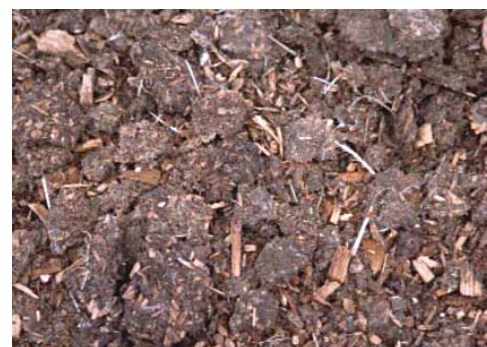
Figure 1. Typical broiler litter with bedding, feathers and manure.

Poultry litter is a mixture of bedding materials (rice hulls, sawdust, wood chips, etc.) and animal excreta (Figure 1). The nutrient content of