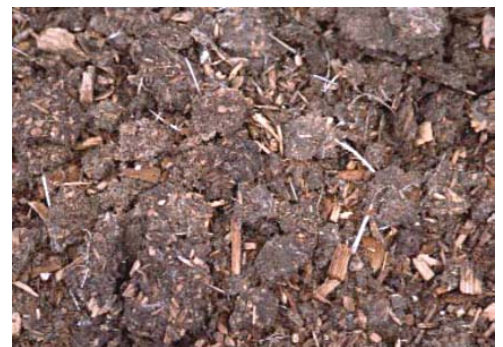
Figure 1. Typical broiler litter with bedding, feathers and manure.

Poultry litter is a mixture of bedding materials (rice hulls, sawdust, wood chips, etc.) and animal excreta (Figure 1). The nutrient content of